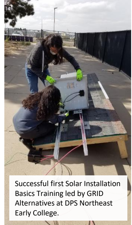
Successful first Solar Installation Basics Training led by GRID Alternatives at DPS Northeast Early College.