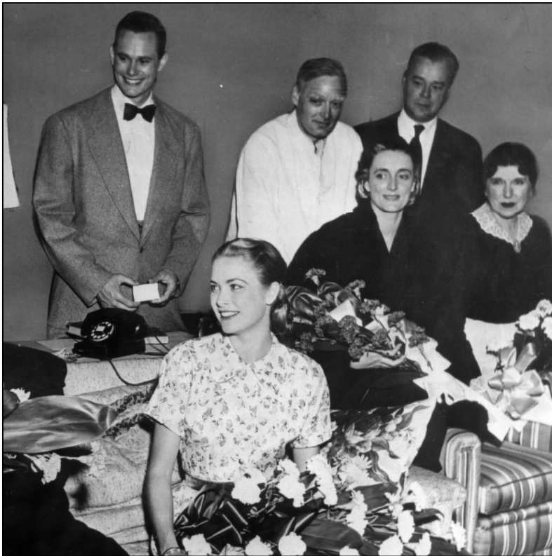
Denver Public Library, Western History and Genealogy

History 1C Have direct and substantial association with a person or group of persons who has influence on society.