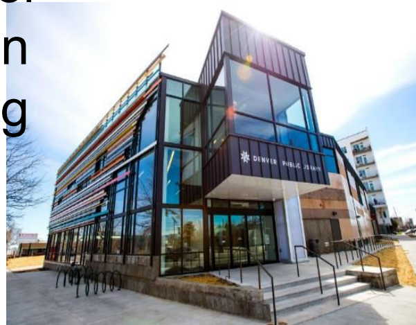
Rodolfo "Corky" Gonzales Branch Library*

* photos courtesy of Studiotrope Design Collective