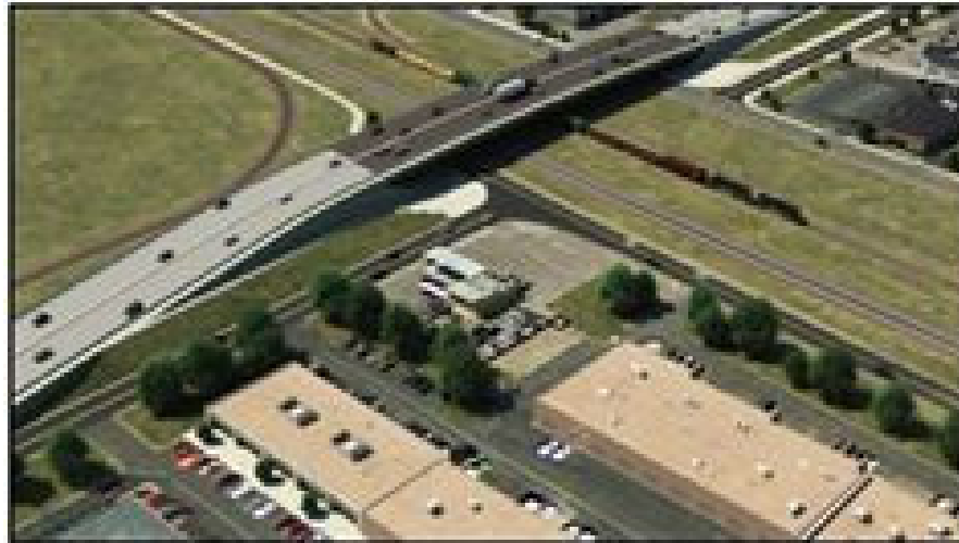
Peoria Grade Separation