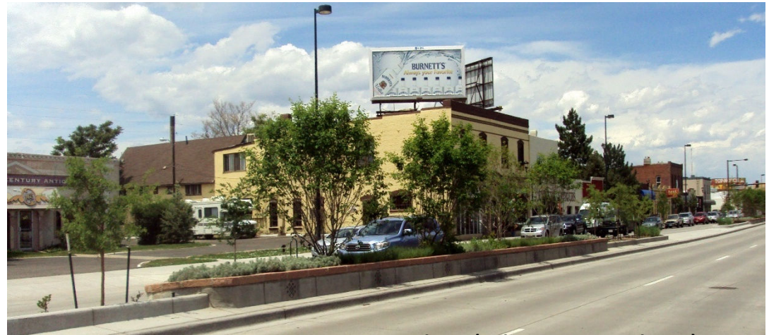
Street Recon: Broadway (Asbury St to Wesley St)

Additional Funding will enable final segment of Broadway (Mississippi to Kentucky) to be completed.