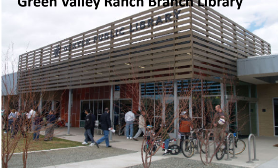
Green Valley Ranch Branch Library

This action will transfer remaining funds for on renovations of existing Libraries.