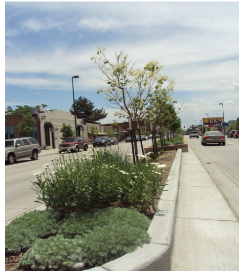
Upgraded Median on Broadway