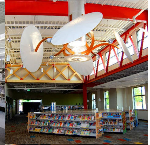
Stapleton Branch Library