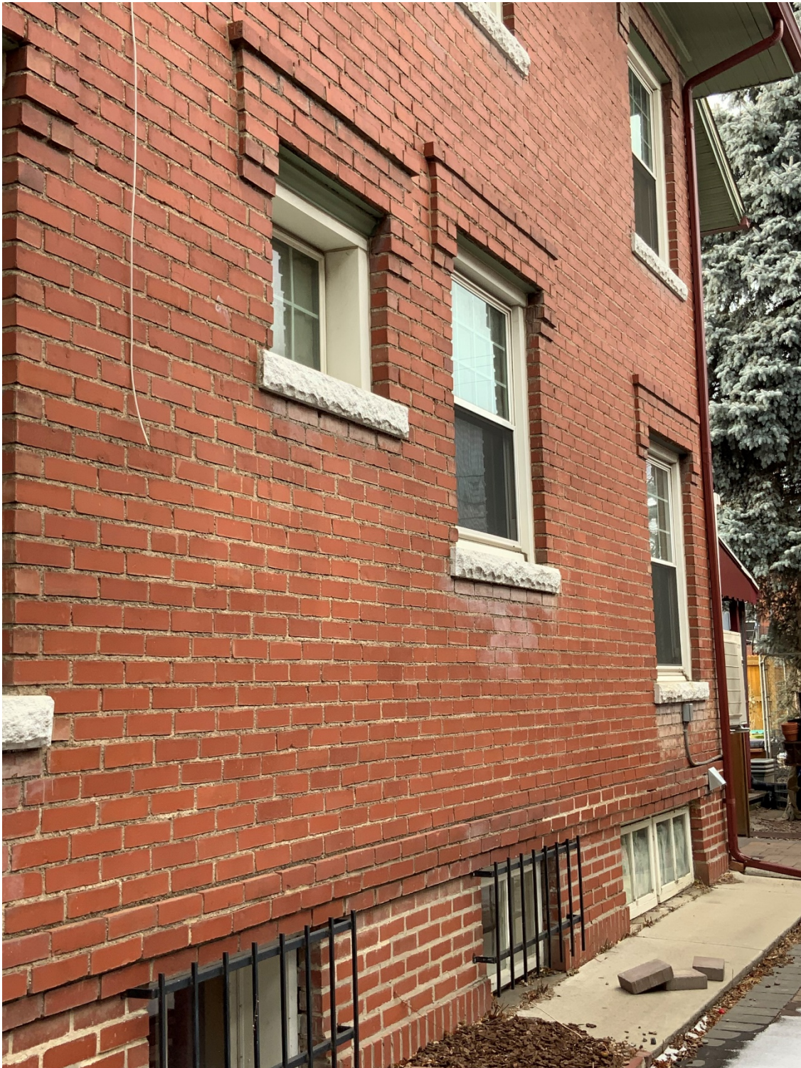
Partially raised basement with windows (north façade). Brick soldier course at grade level and brick belt course projecting above basement windows. Note masonry repointing over the years has resulted in a lack of uniform coloration in the mortar joints