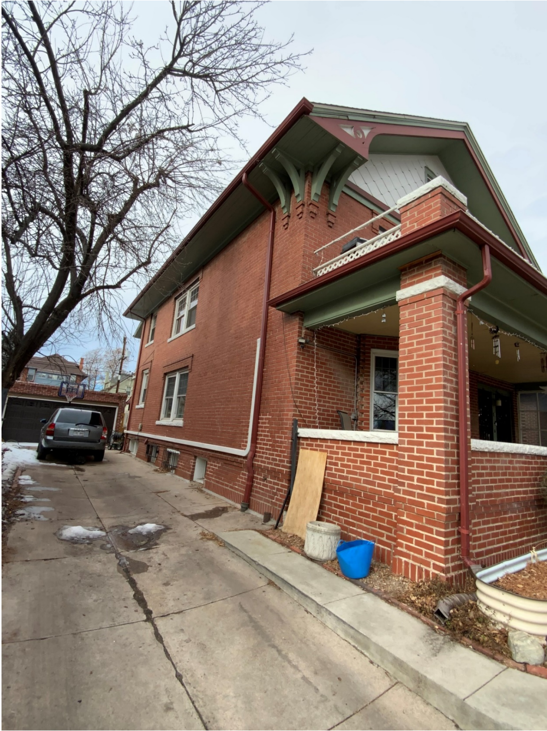
South Façade - Irving P. Andrews home 2241/43 York St with original garage structure at terminus of driveway accessed from York Street