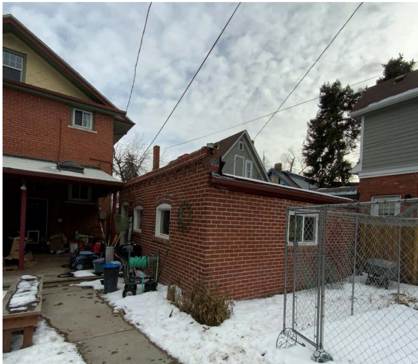
West Façade -Original Garage

Original Garage, replacement pedestrian door and windows in original openings