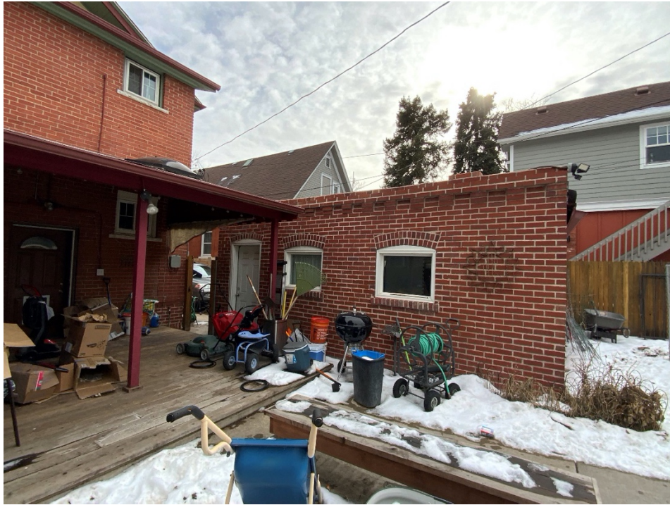
North Façade -original garage