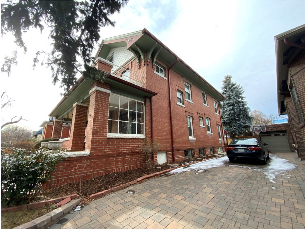
North Façade looking southwest -note enclosed north side of porch