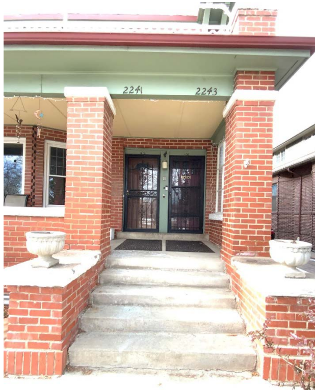
Paired Front doors (First story dwelling 2241 York St. at left door/ Irving P. Andrew's former law office 2243 York Street – right door)