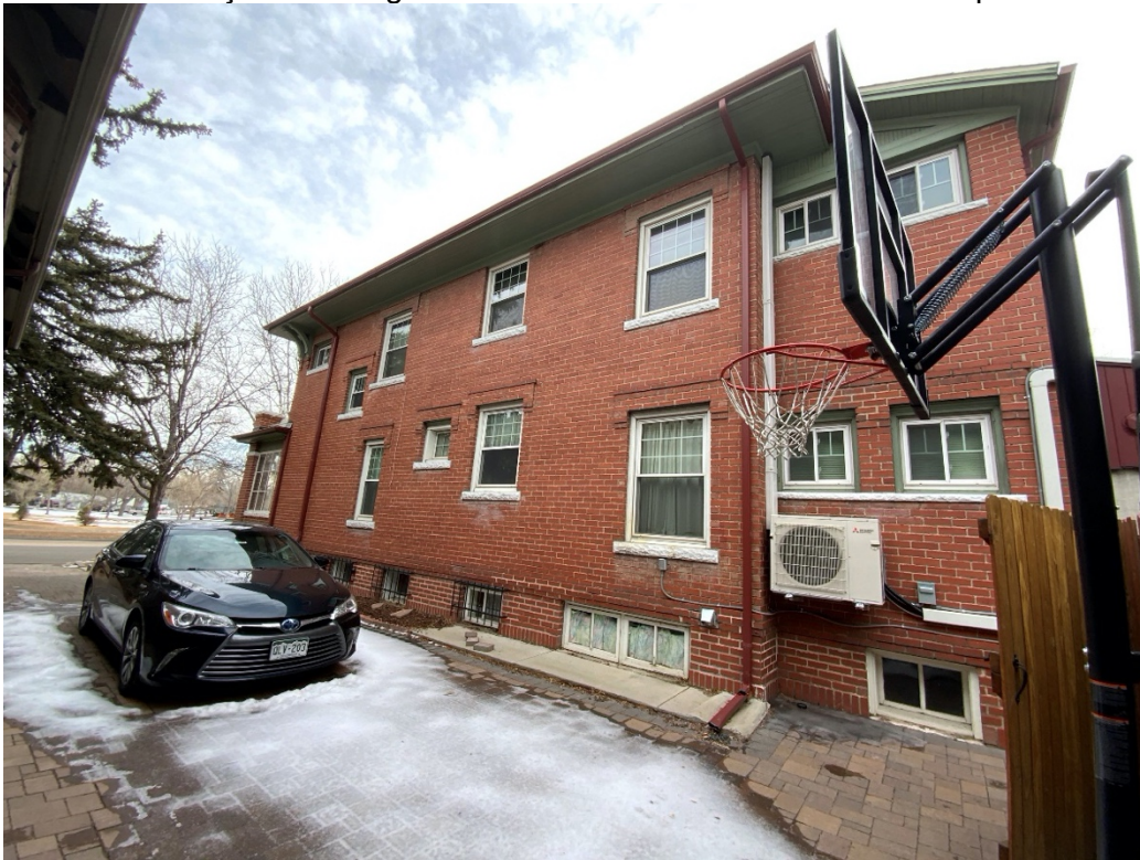
North Façade looking southeast (note inset service wing at right)