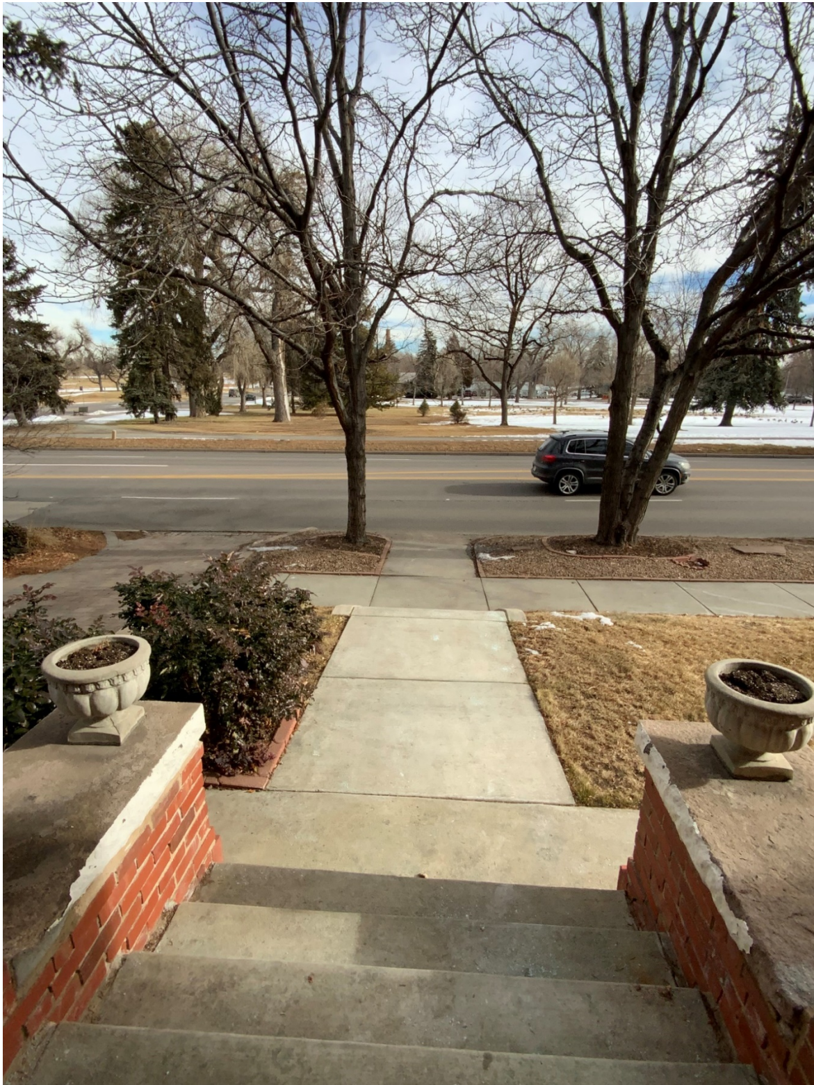
View from front porch looking east towards City Park (unchanged view since the home was constructed in 1914)