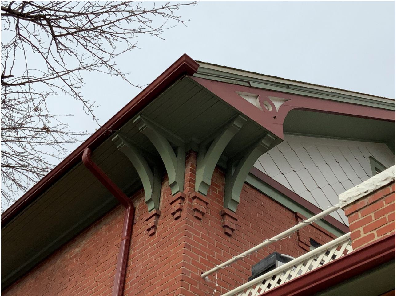
Boxed eave detail with paired corner brackets supported on brick corbels. Note: decorative cornice return detail and asbestos tile in diamond or fish scale pattern in gable end