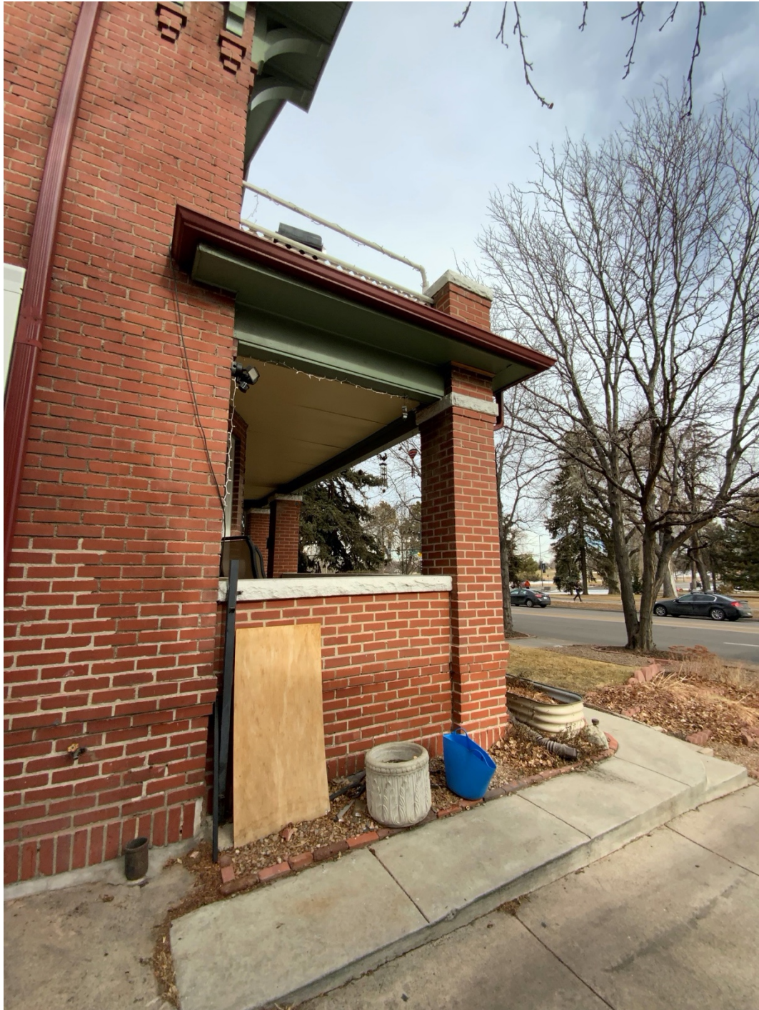
A projecting elevated front porch looking northeast towards city park. Note brick columns extending to upper balcony level of porch. Painted stone (or concrete) caps a porch wall and columns. A brick soldier course at the grade level and slightly corbelled belt course wrap the house. Non-uniform mortar color is visible from repointing over the years.