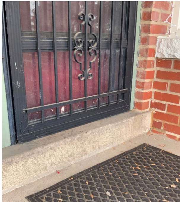
Detail: Bush hammered finish on concrete step/ threshold at front entry doors