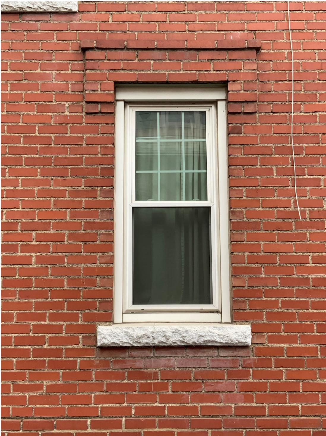
Typical window details: corbelled brick surround, split face stone lug sill, and vinyl replacement window with double hung configuration with internal divisions in upper sash.