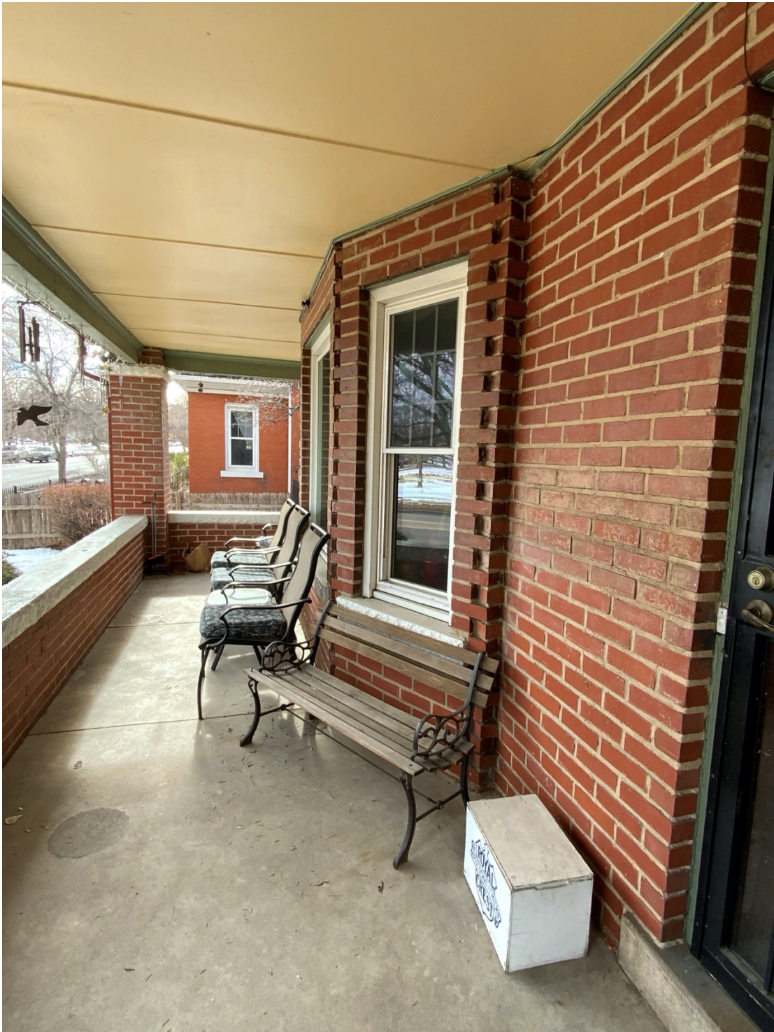
Bay Window at front porch with toothed brick corner detailing, replacement vinyl windows in original openings with internal divisions to emulate original proportions and division