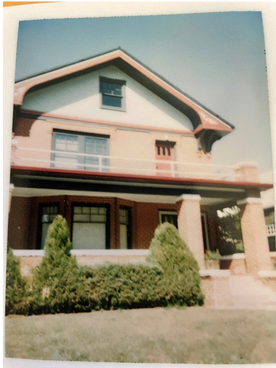
East Façade - Irving P. Andrews home 2241/43 York St (ca.1985)