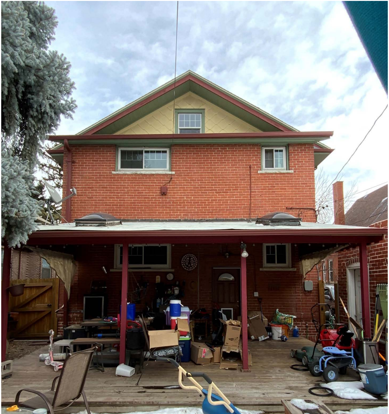
West Façade looking towards circulation extension and covered porch with bubble skylights (later addition). Original garage visible to the right of the porch.