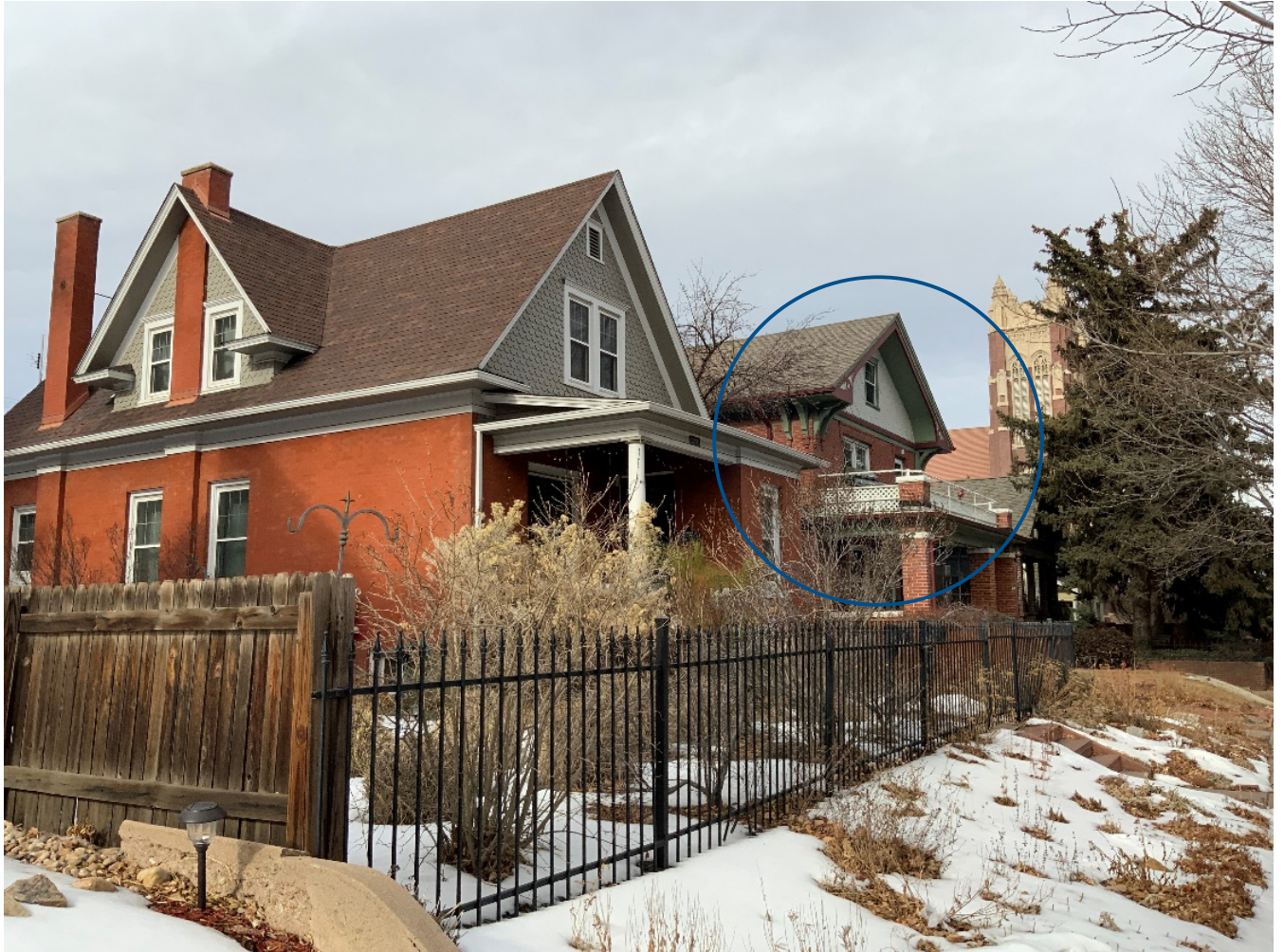
Streetscape view looking toward Irving P. Andrews home 2241/43 York St with St Ignatius Loyola Church in the background