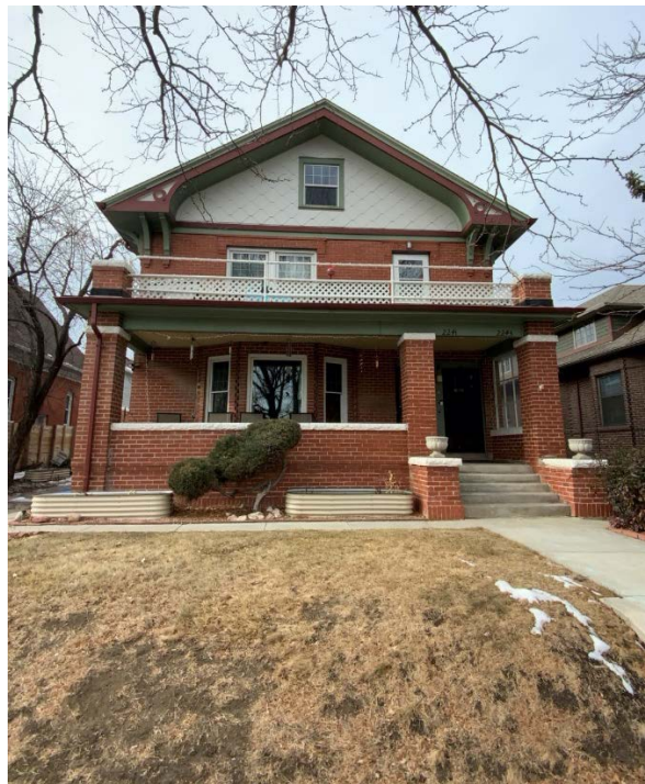
East Façade - Irving P. Andrews home 2241/43 York St (2022)