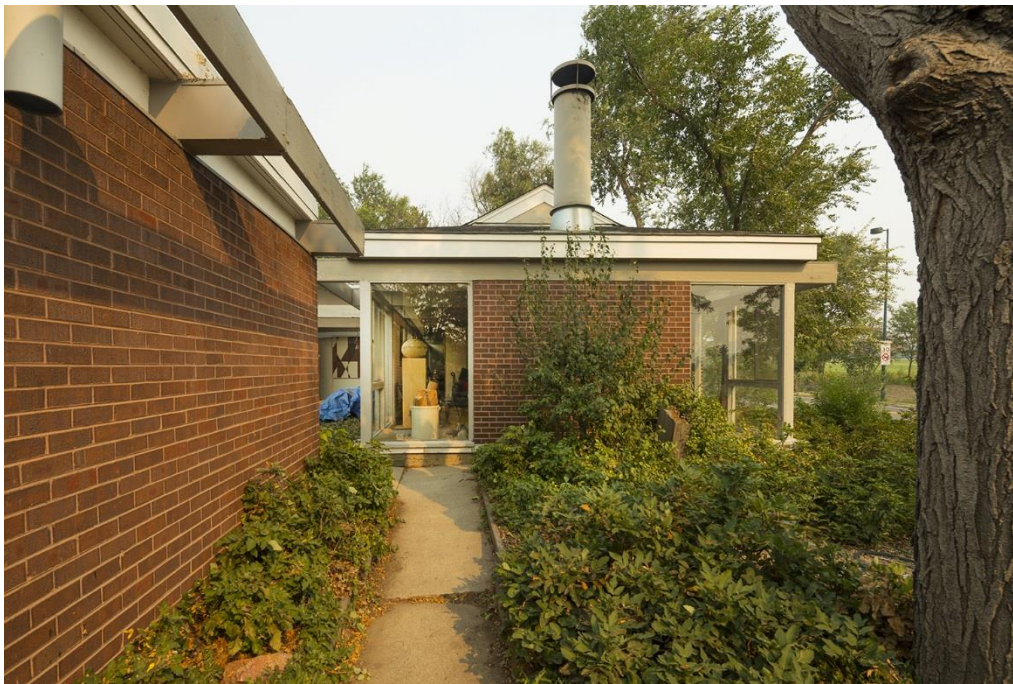
4. 2600 N. Milwaukee St., view of the southern wing's western end. Facing east.