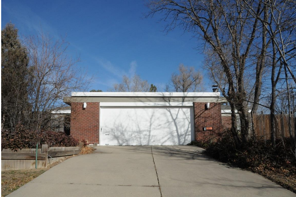
3. 2600 N. Milwaukee St., detached garage on the western side of the property. Facing east. March 2018.