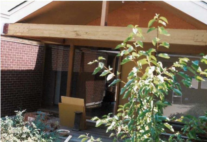
9. 2600 N. Milwaukee St., western entry way.