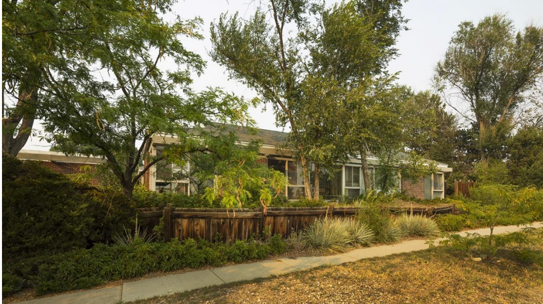
1. 2600 N. Milwaukee St., southern wing. Facing northeast.

Attach at least four (4) 5x7 or larger color photographs showing the views of the property from the public right of way(s) and any important features or details. If available, attach copies of historic photographs of the structure.