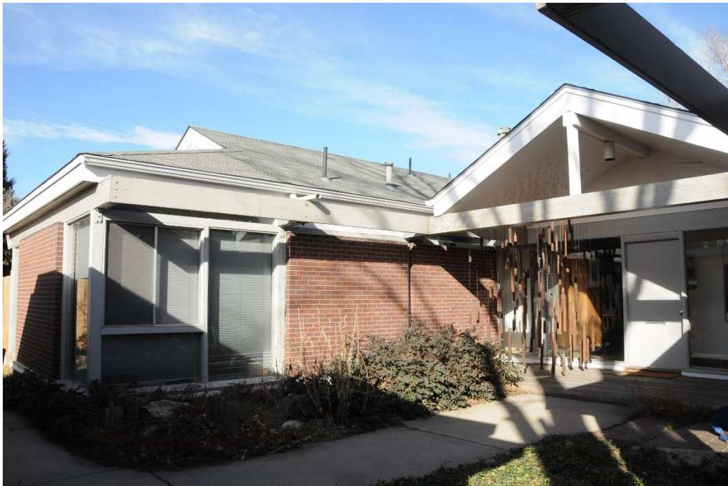
6. Western entry with artwork seen through the windows, including sash weights to the left of the entry. Facing east. Image by Shannon Schaefer Stage, February 2018.