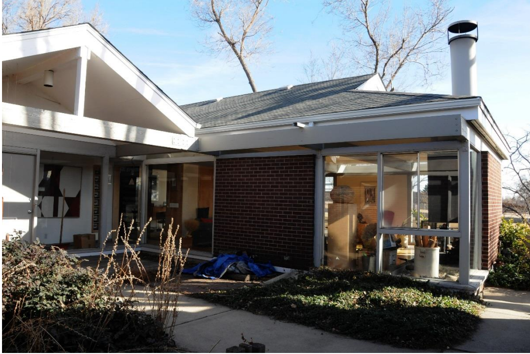
5. 2600 N. Milwaukee St., southern wing western entry and corner windows in western wing. Image by Shannon Schaefer Stage, March 2018.