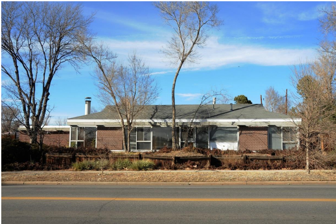
2. 2600 N. Milwaukee St., south façade and southern wing. Facing north. Image by Shannon Schaefer Stage, March 2018.