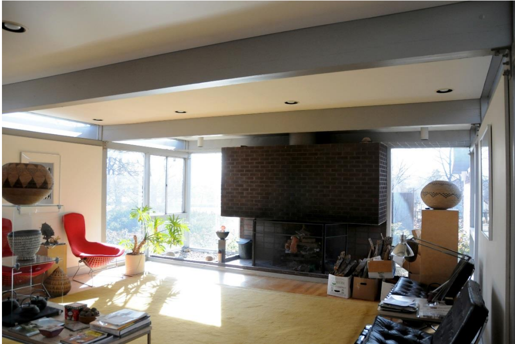
7. 2600 N. Milwaukee St., western wing facing southwest. Image by Shannon Schaefer Stage, March 2018.