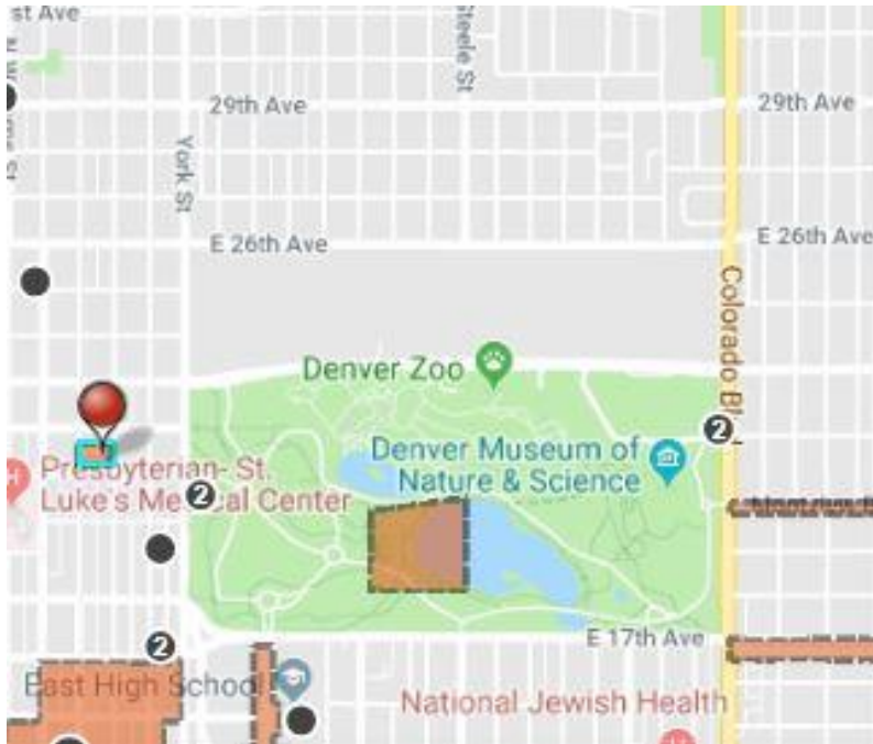
11. Historic Landmarks & Districts in the neighborhood surrounding City Park.