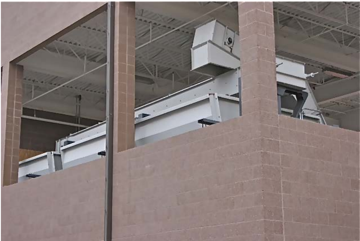
View of mulching machine from City Park Road