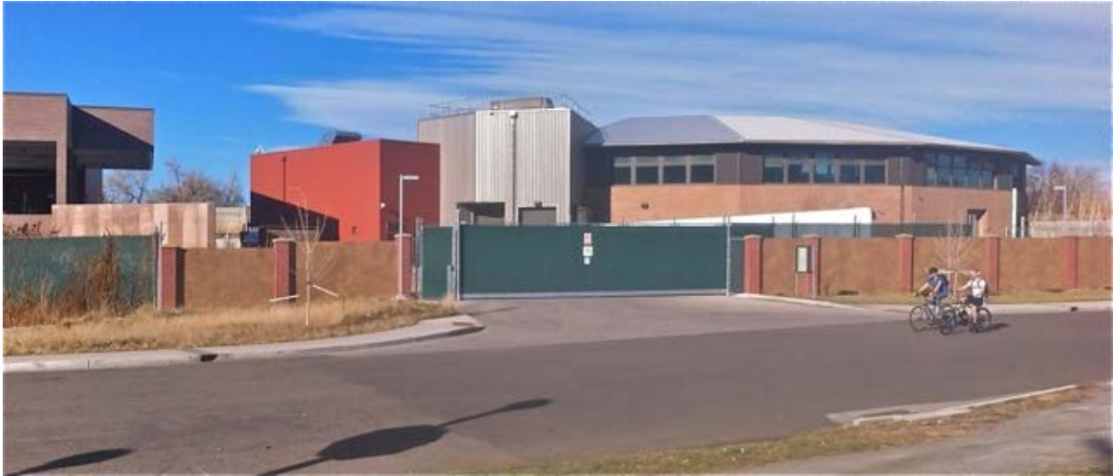
Zoo's Plant as seen from North Side of Ferril Lake, inside City Park