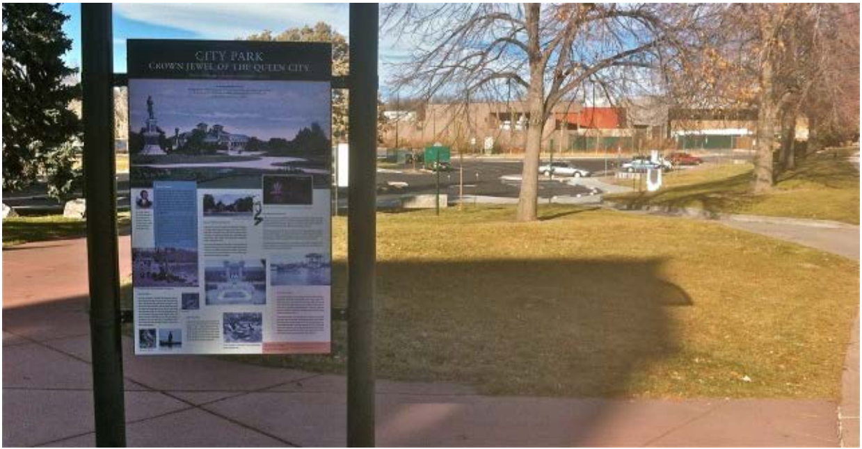
View of Zoo's Plant from City Park Pavilion