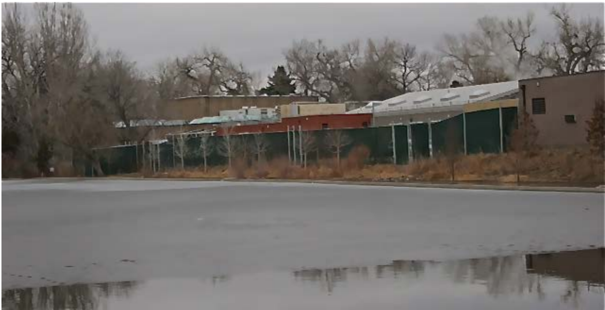
View from Duck Lake - where children stand to watch birds