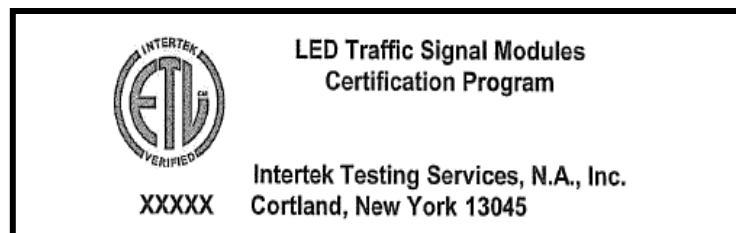
Figure 2 Intertek- ETL Verified Label