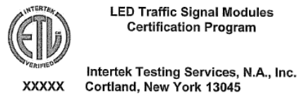
Figure 1. Intertek- ETL Verified Label

5.1.4.3 For firms with business and/or corporate citizenship in the United States of less than fifteen years, the process by which the end-users/owners of the modules will be able to obtain worst-case, catastrophic warranty service in the event of bankruptcy or cessation-of-operations by the firm supplying the modules within North America, or in the event of bankruptcy or cessation-of-operations by the owner of the factory of origin, shall be clearly disclosed.