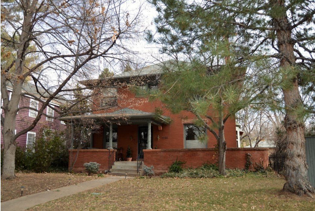
Figure 2 2288 S Milwaukee St, 2019

given its substantially-sized footprint and wraparound, uncovered front porch. It demonstrates the character-defining features of the Foursquare form as a two-story hipped roof structure with minimal decoration, broad overhanging eaves, classical frieze with dentils, and porch. It is unique given the absence of a full front porch and large dormer with a Palladian window, common design elements that Huntington included in other Foursquare designs yet illustrates other Huntington trademarks like the use of brick and rough-cut stone at the foundation, lintels and sills. It is an excellent, intact example of an early Foursquare form and Huntington design.