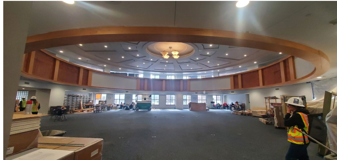
The Commons: Rendering to Actual