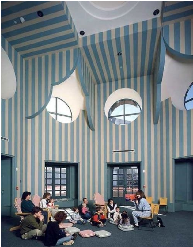
Former children's storytime room