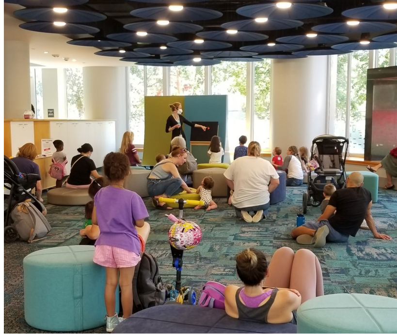
New Children's Library opened in April 2022