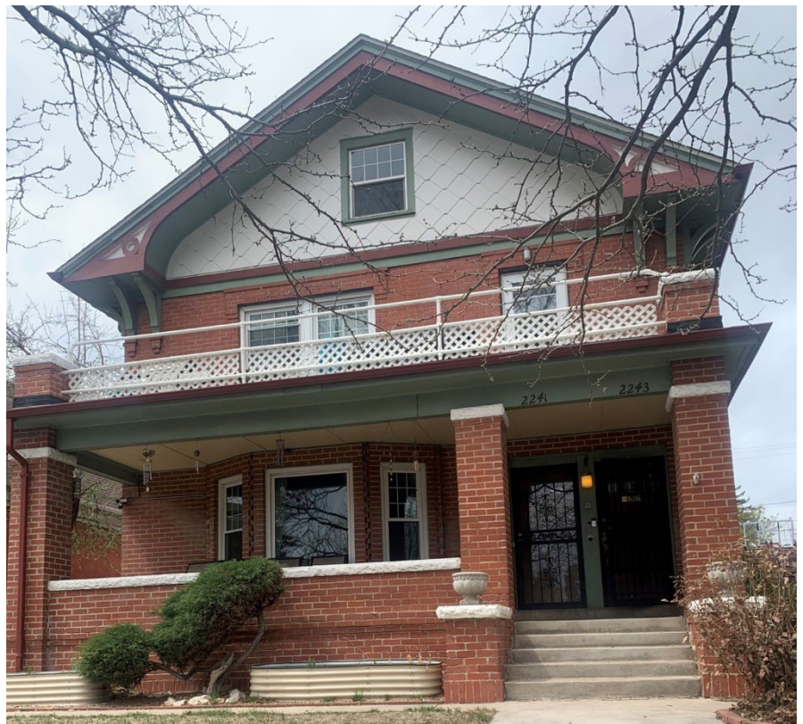
Figure 2. 2241-43 York Street front facade.

The property at 2241-43 York Street embodies the distinctive physical characteristics of the Free Classical Queen Anne style, and is an excellent example of a duplex typology. This style utilized the gable-front form popular with Queen Anne homes, but reigned in the ostentatious detailing of earlier Queen Anne structures. The use of decorative shingles in the gable end is a hallmark of the Queen Anne style, while the window hood surrounds and decorative knee braces are more subdued than what is found in earlier Queen Anne styles. The home's construction in 1914 came at a moment when the United States was deep in a recession, and the world was on the brink of the first world war. Demand for the ornate, highly detailed houses in the Queen Anne style had dwindled, and an era of restraint had begun.