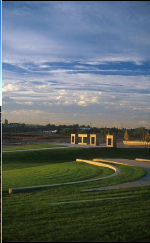
An award winning park