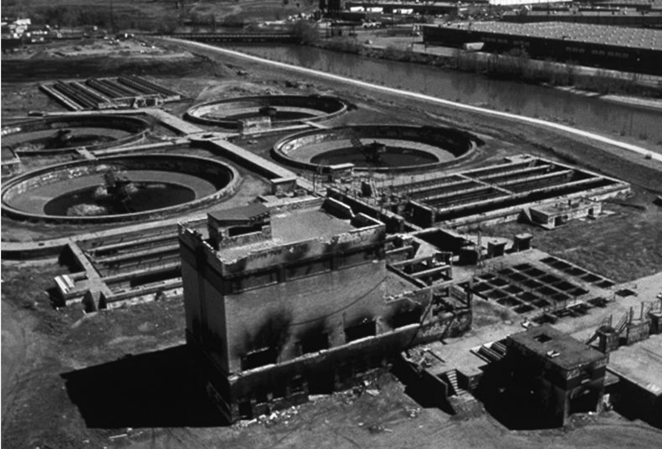
Northside Wastewater Sewage Treatment Facility