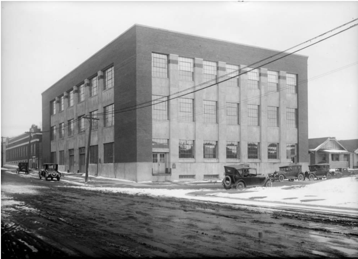
Photo of north and west elevations of Cadillac Service Building (ca 1920 – 1930)