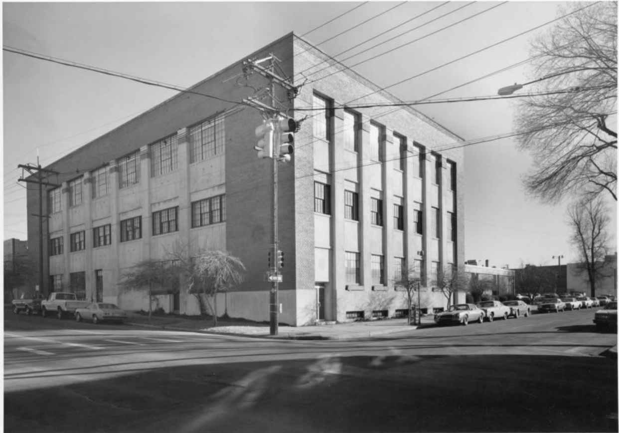
Cadillac Service Building (1981)