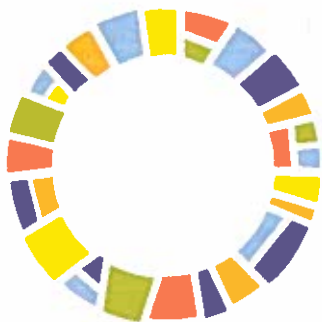
INTERFAITH ALLIANCE OF COLORADO PROTECTING FAITH AND FREEDOM