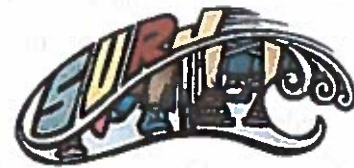
SHOWING UP FOR RACIAL JUSTICE Denver Chapter