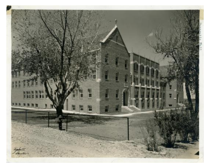
I to r: 1930 and 2021