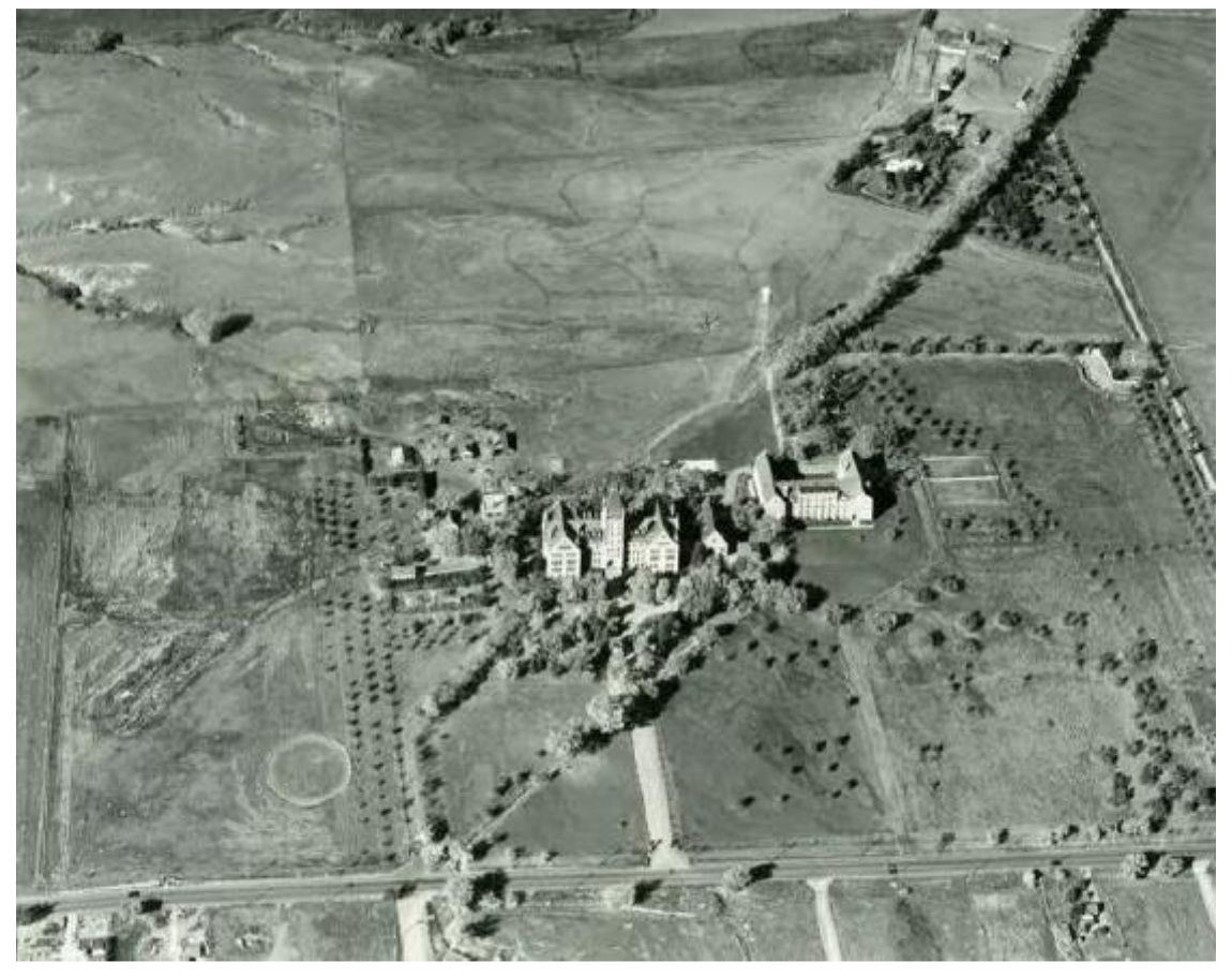
Loretto Heights Campus Aerial, 1945