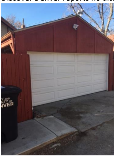
770 Steele, Garage (non-contributing)

Discover Denver reports no alterations on the house, garage post-dates construction of house.