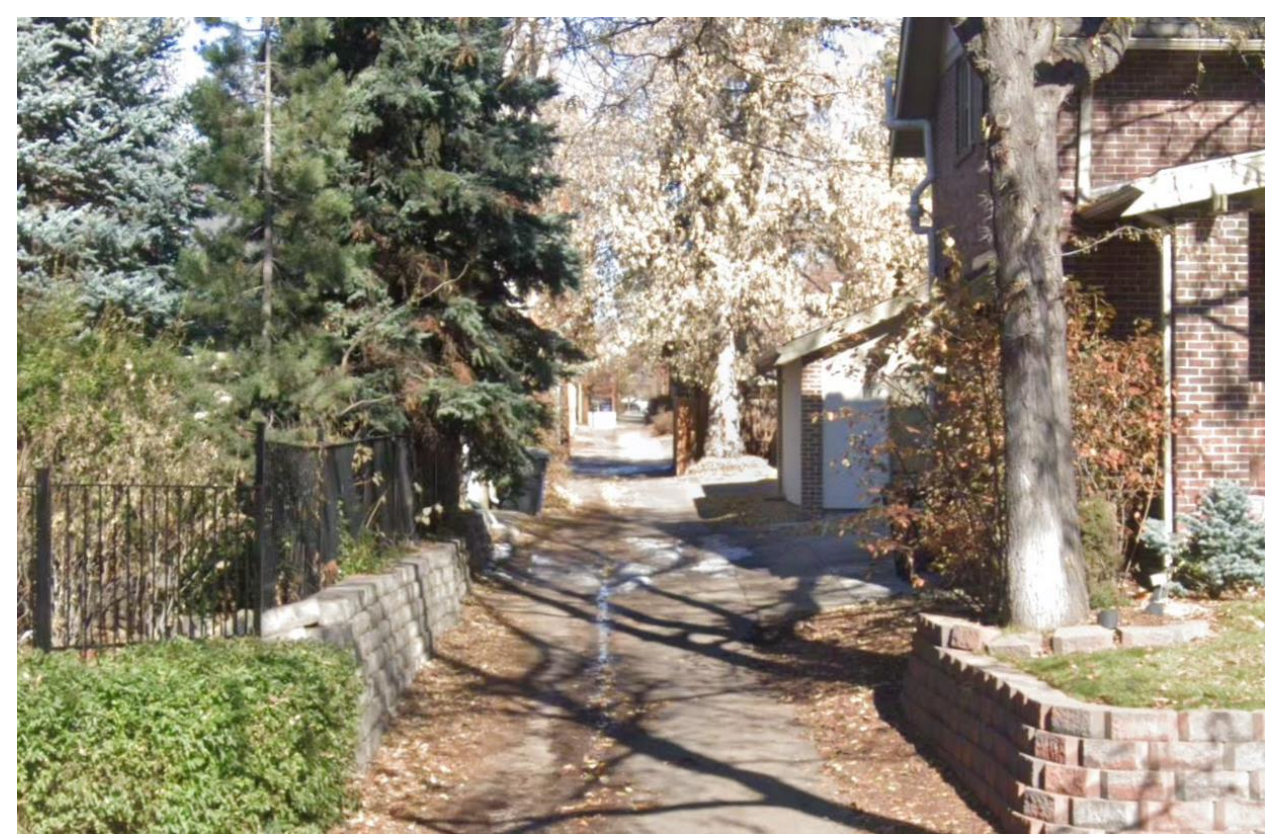
View of the alley from 17<sup>th</sup> Avenue Parkway, looking north.