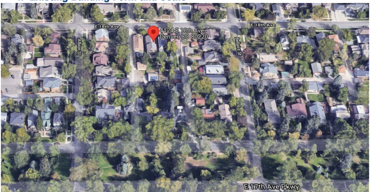
4. Existing Building Form and Scale

Aerial view of the site, looking north.