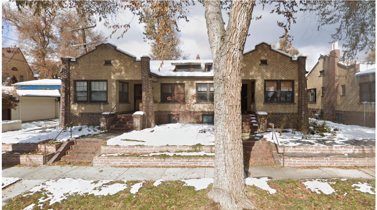
View of the multi-unit properties across street from the subject property, looking north.