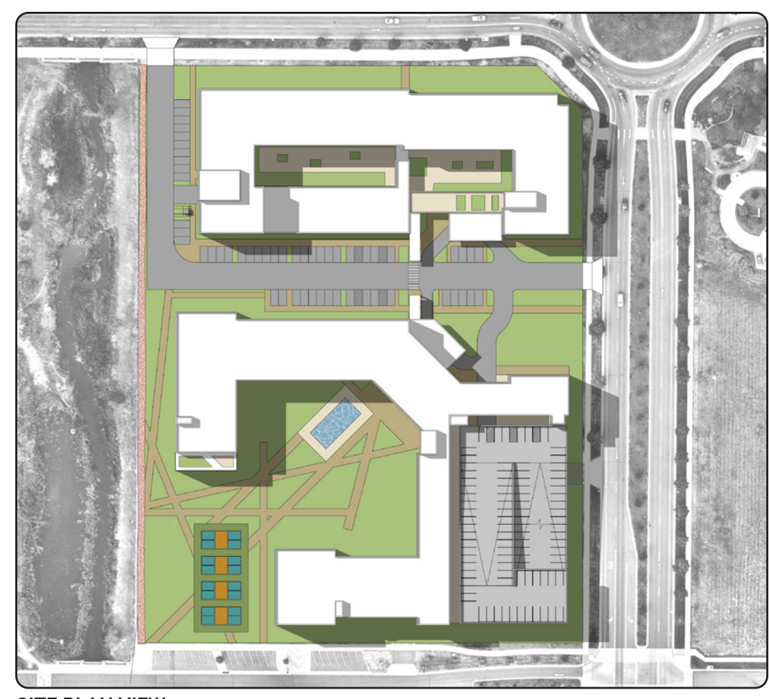
SITE PLAN VIEW