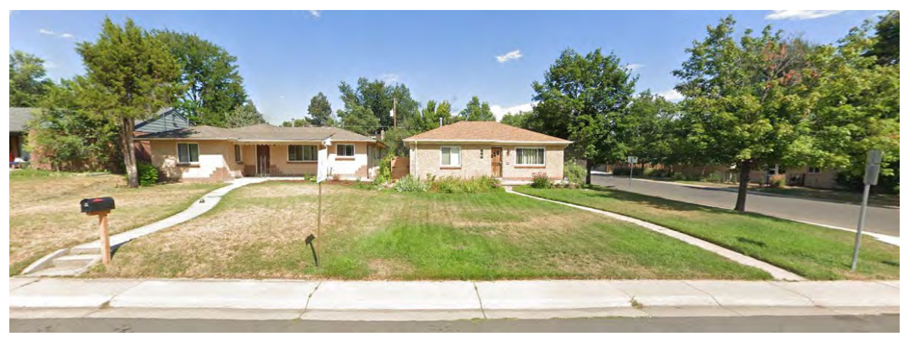
View of the site (on the right) looking east, with a neighboring home to the north (left).