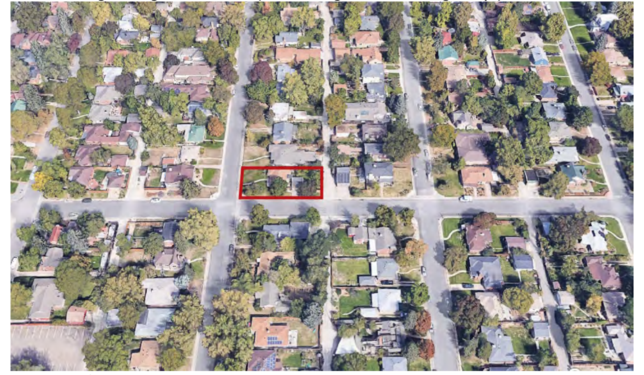
Aerial view of the site looking north.

3. Existing Building Form and Scale