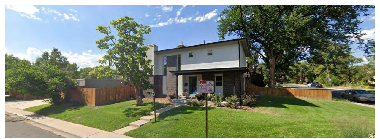
View of single unit dwelling to the east, looking north.