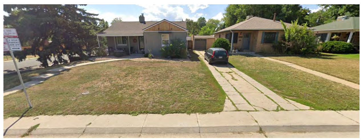
View of single-unit dwellings across Eudora Street, looking west.