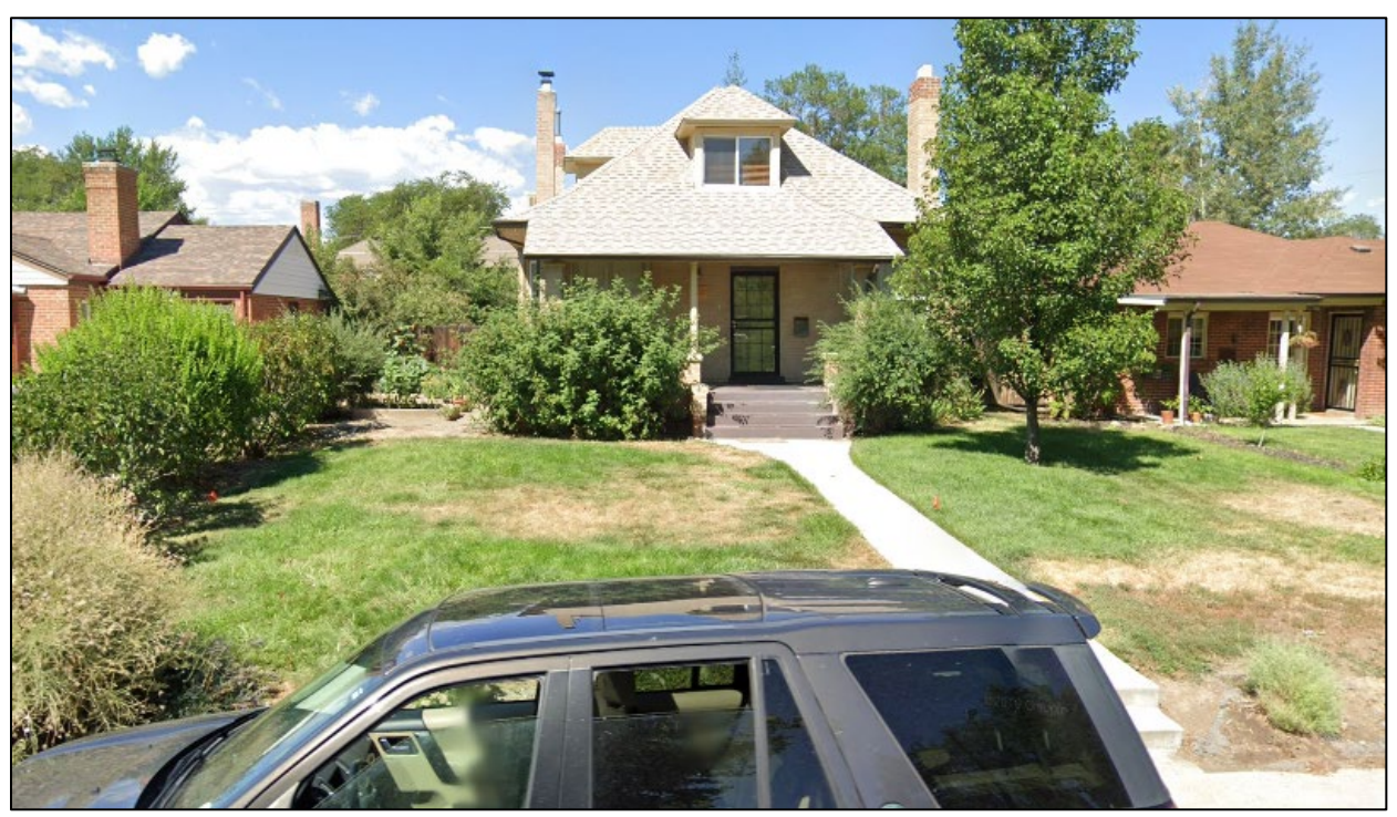
View of the property to the south, looking west.