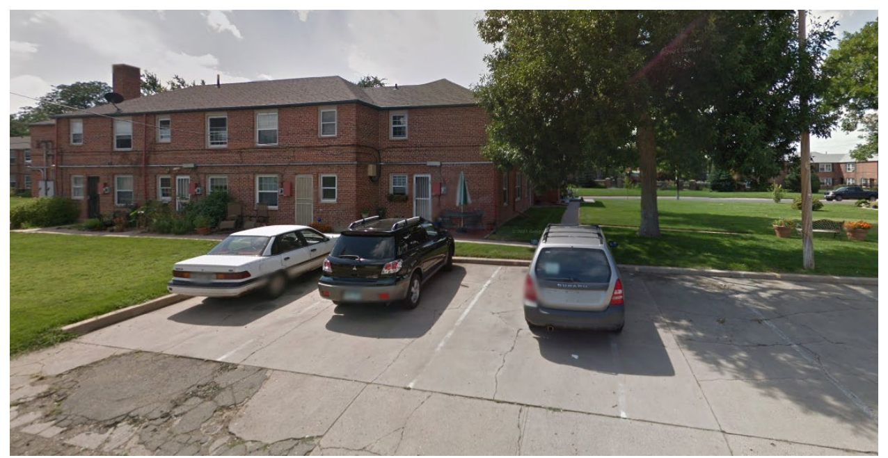
View of the property to the west (across the alley), looking west.