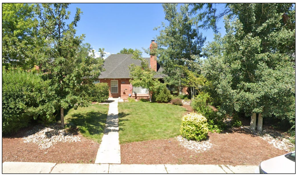
View of the property to the north, looking west.