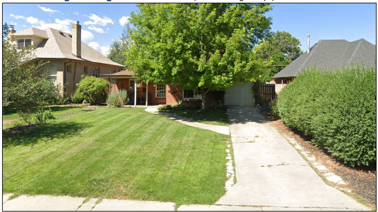
View of the subject property looking west.