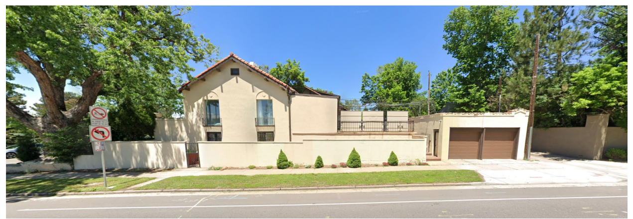
Subject Site – View of the subject property, looking north.