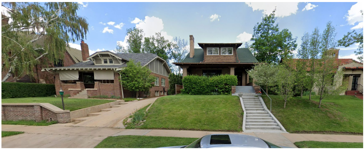
North - View of the properties to the north, looking east.