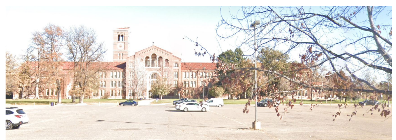
South - View of the property to the south, looking east.