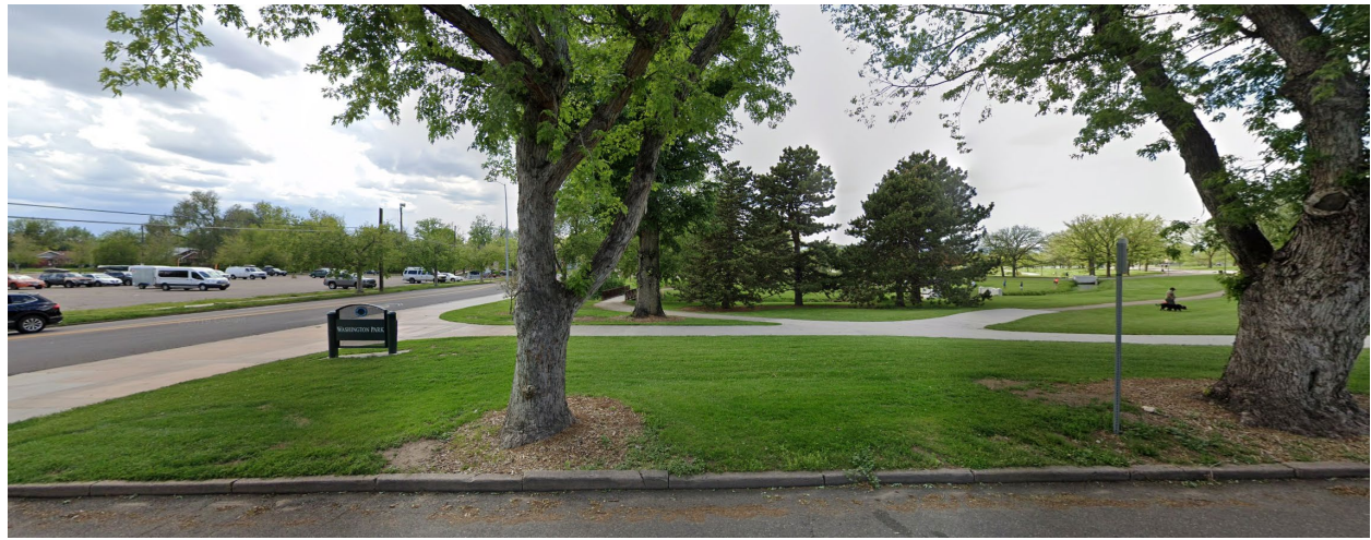
West - View of Washington Park to the west, looking west.