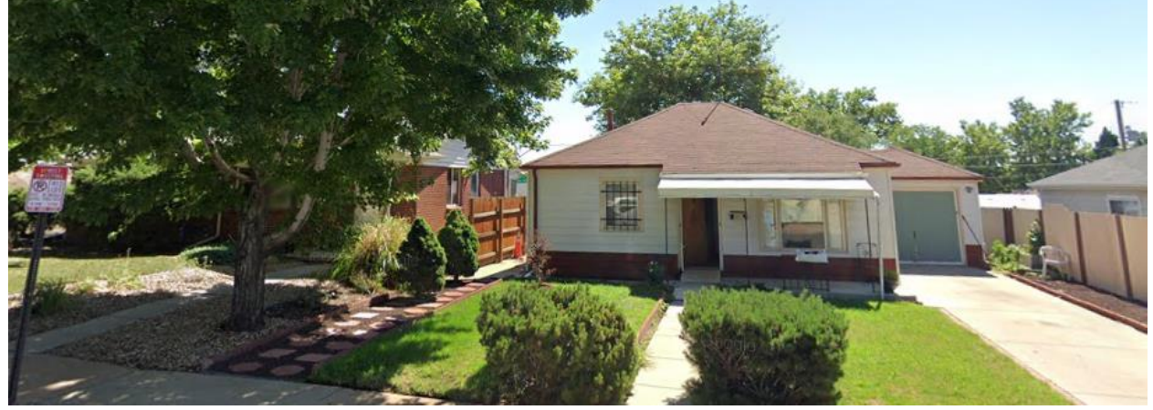
View of single unit homes north of the subject properties, looking east.