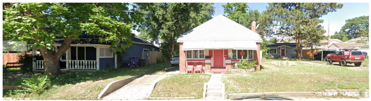
View of single unit homes across the street of the Clay properties, looking west.

View of the 4740, 4750 and 4758 Clay properties, looking east.