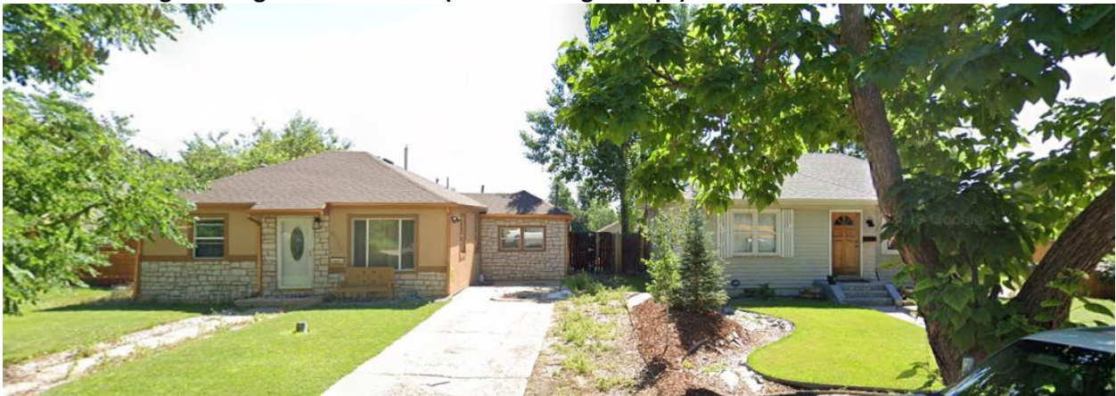
View of the 4722 and 4730 Clay properties, looking east.

3. Existing Building Form and Scale