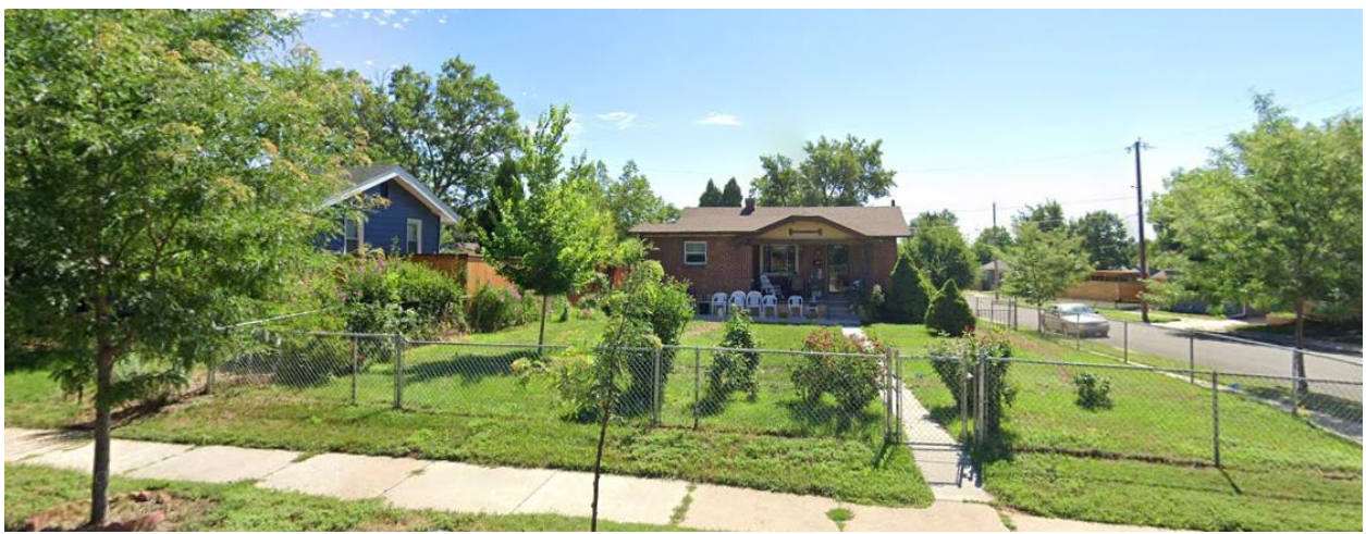
View of single unit homes south of the subject properties, looking east.