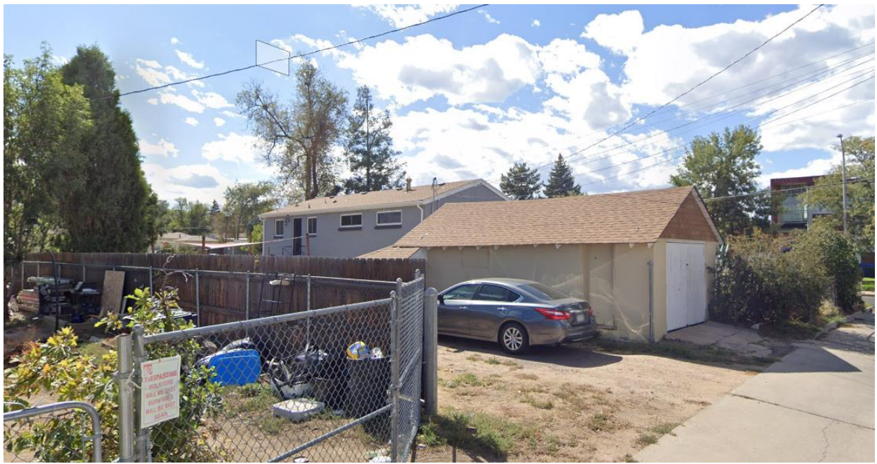
View of the rear of the lot from the alley, looking south.