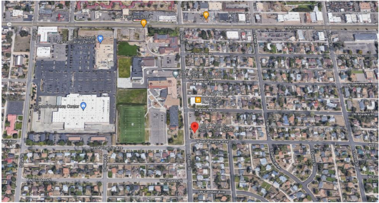
Aerial view of the subject site, looking north.