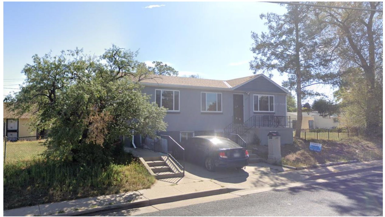
View of subject property looking east.