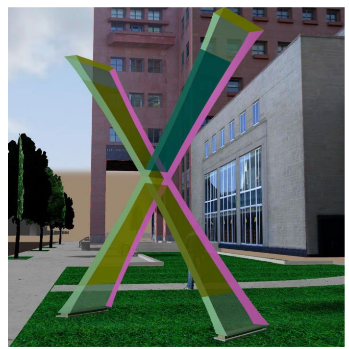
Sculpture 2 – "Equis"