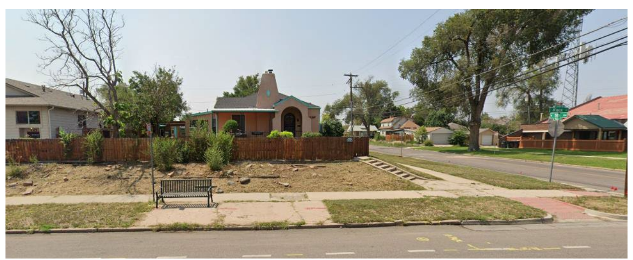
Site – Subject property, looking west from North Knox Court