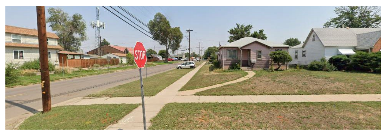
West – Property to the west, looking east on North King Street