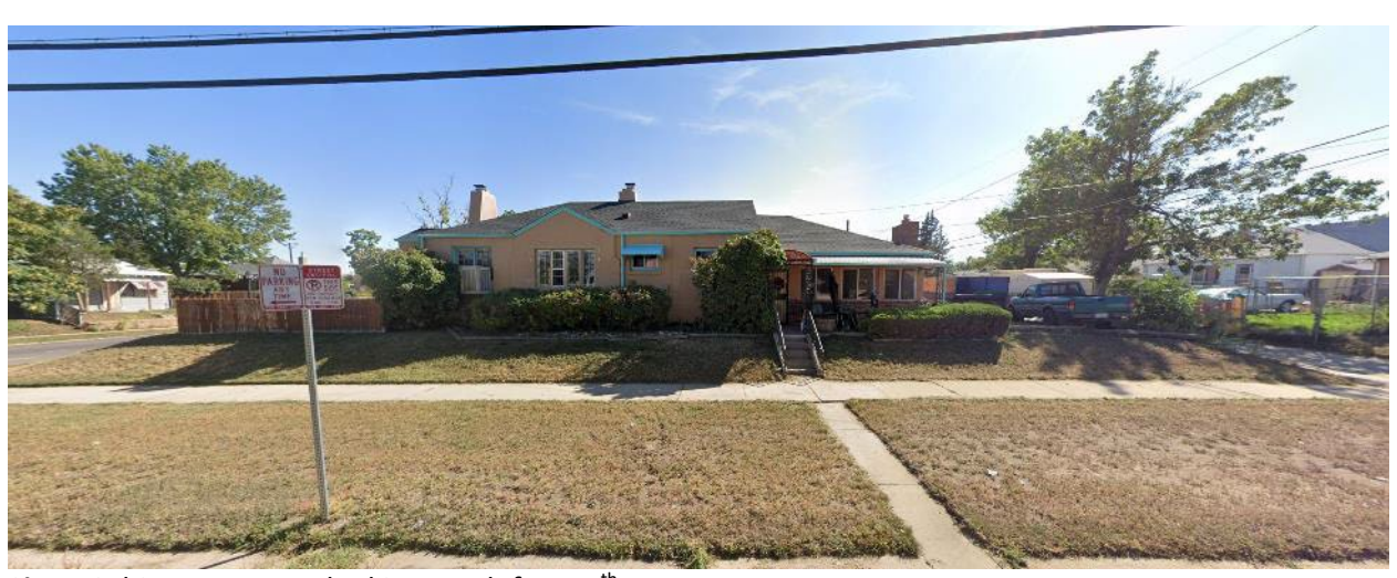
Site – Subject property, looking south from 5<sup>th</sup> Avenue