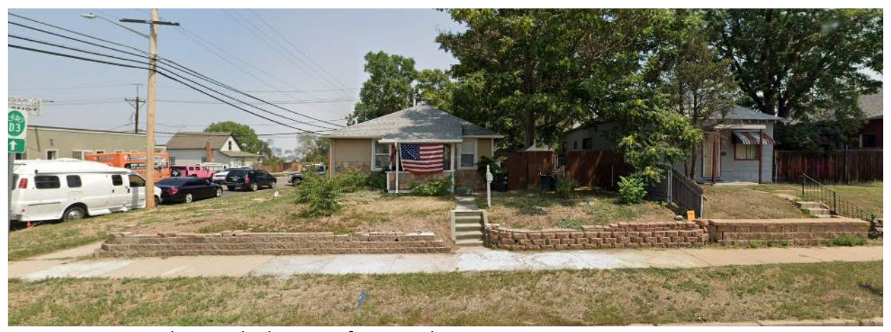
East – Property to the east, looking east from North Knox Court