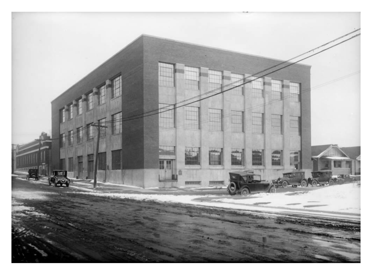
Photo of north and west elevations of Cadillac Service Building (ca 1920 – 1930)