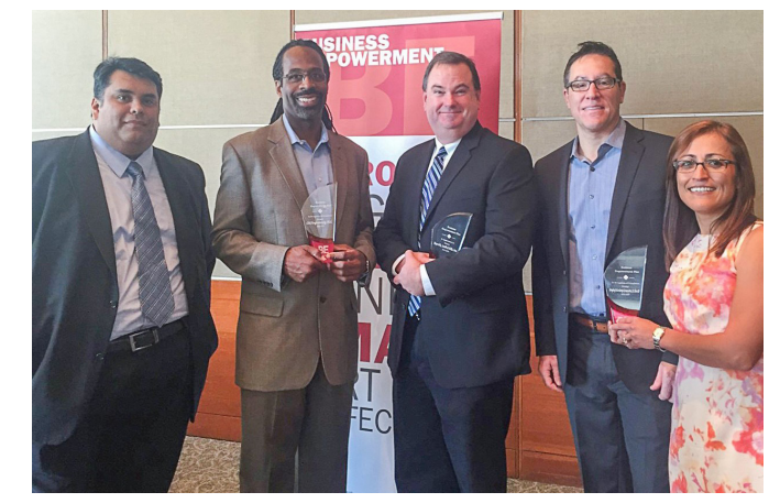
San Antonio Mentor/Protégé graduation ceremony. RS&H led a Mentorship Program as part of the City of San Antonio General Engineering Consultant Contract.

Another example is when RS&H led a Mentorship Program for the City of San Antonio General Engineering Consultant Contract where RS&H was the prime consultant. RS&H committed to mentoring two local Small Business Economic Development Advocacy program (SBEDA) firms, CNG Engineering and Gonzalez-De La Garza & Associates