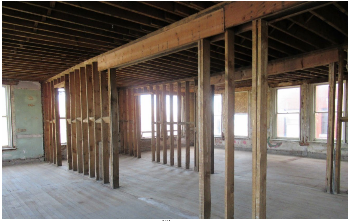
Figure B-18. Interior of 1898 structure.<sup>101</sup>