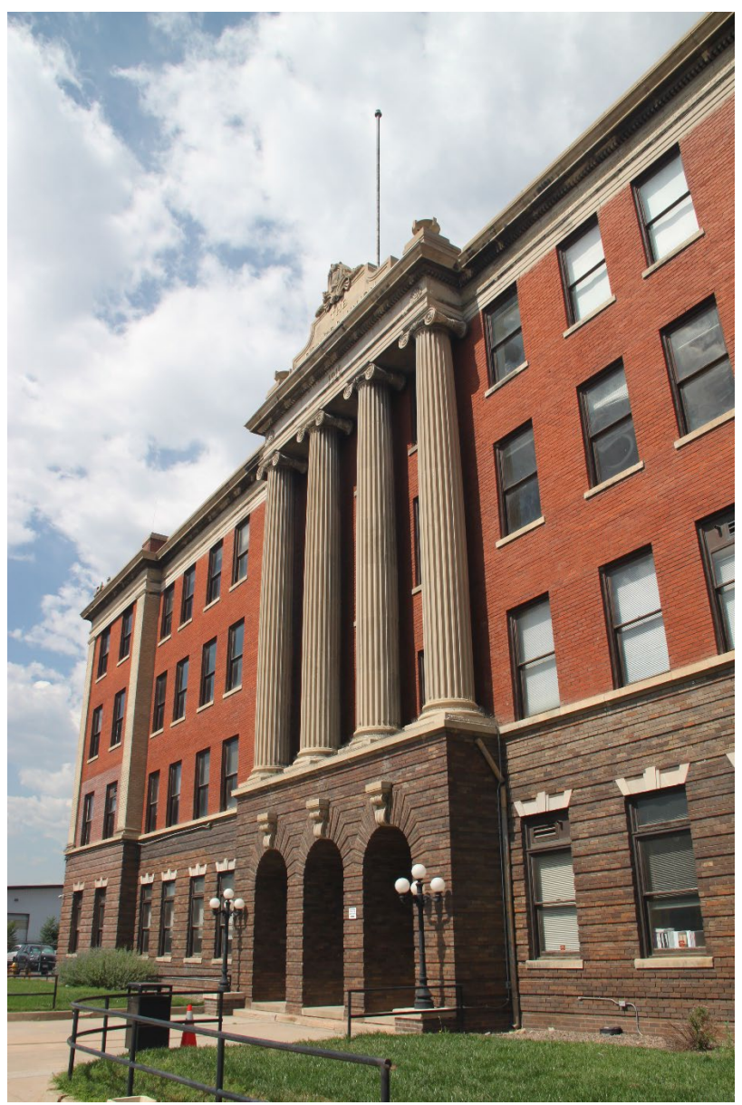
Figure B-7. Detail of Classical Revival 1916 main entry portico, columns, and other decorative features. View facing southwest.<sup>86</sup>