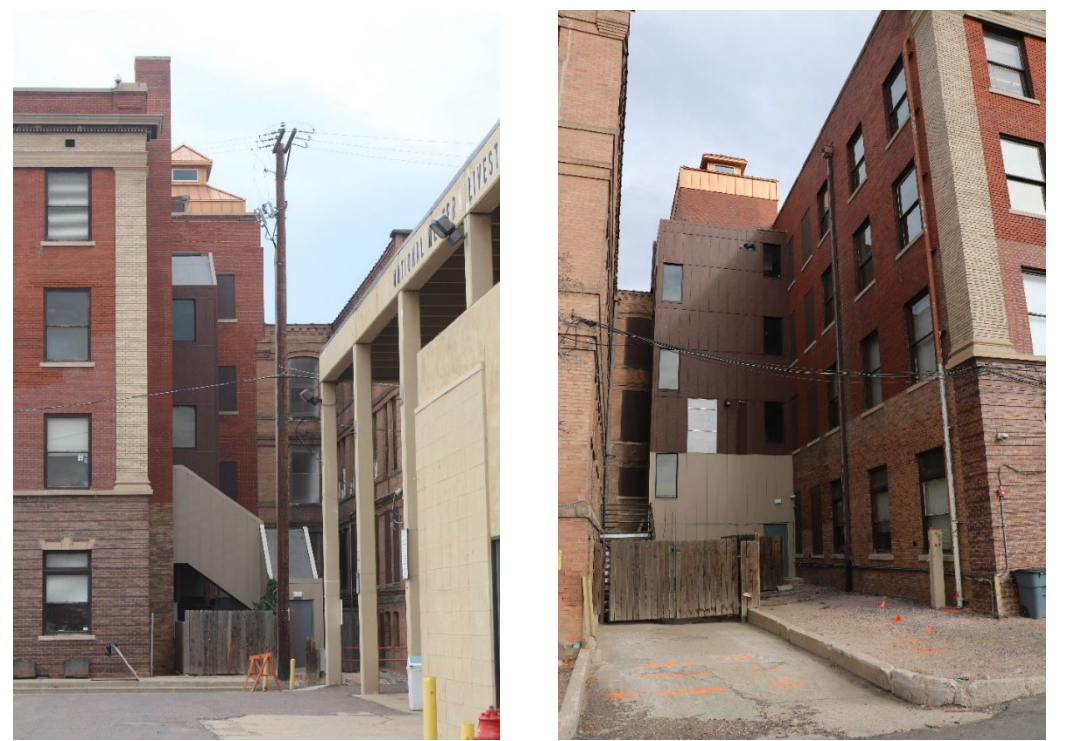
Figures B-11 and B-12. Connection between 1916 and 1898 structures, southwest (left) and northeast (right). Elevator tower with metal cupola and modern fire escape.<sup>90</sup>