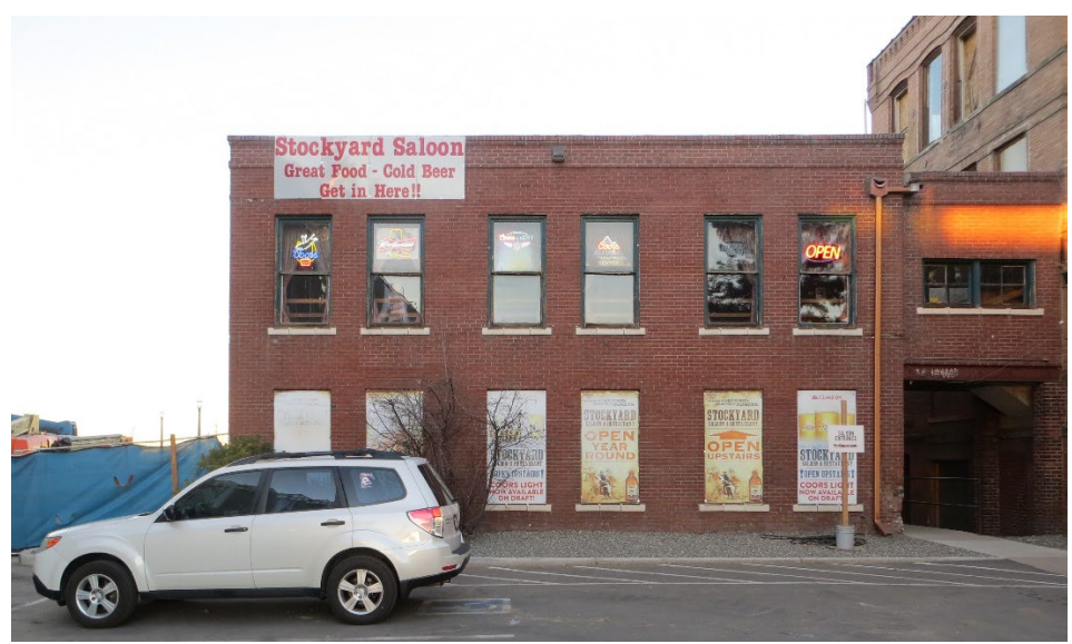
Figure B-14. 1919 structure, view facing northeast.<sup>92</sup>