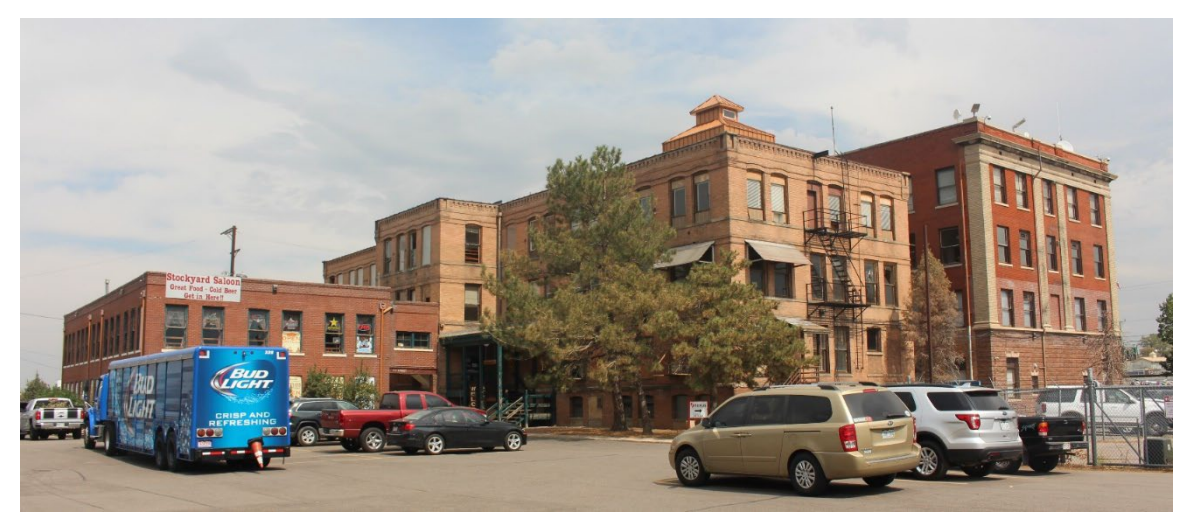
Figure B-9. Side (southwest) elevations of the Livestock Exchange. View facing northeast.<sup>88</sup>