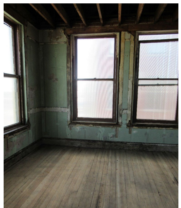
Figure B-19. Interior of 1898 structure.<sup>102</sup>