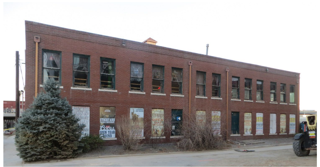
Figure B-15. 1919 structure, view facing southeast.<sup>93</sup>