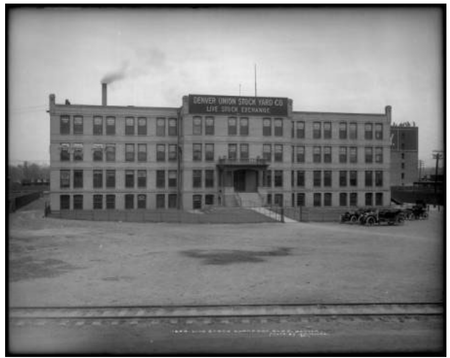
Figure B-1. 1908 photo of the 1898 Livestock Exchange structure showing the original facade, portico, and corner finials. <sup>80</sup>