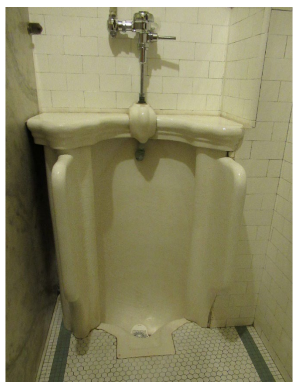
Figure B-16. Bathroom features including marble stall and urinal and hexagonal tile floor, 1916 structure. <sup>99</sup>