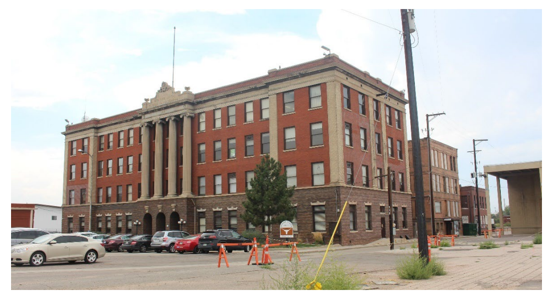
Figure B-8. Side (northeast) elevations of the Livestock Exchange showing all three structures. Left to right: 1916 structure, 1898 structure, 1919 structure View facing southwest. <sup>87</sup>