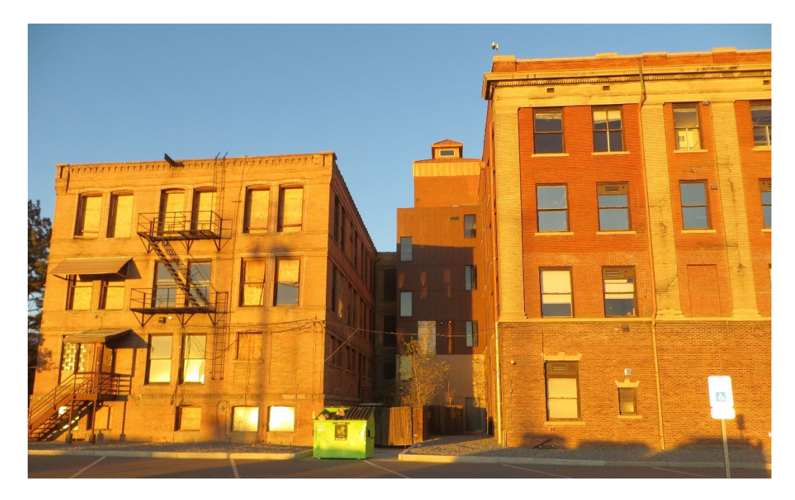
Figure B-17. 1898 (left) and 1916 (right) structures, view facing northeast.<sup>95</sup>