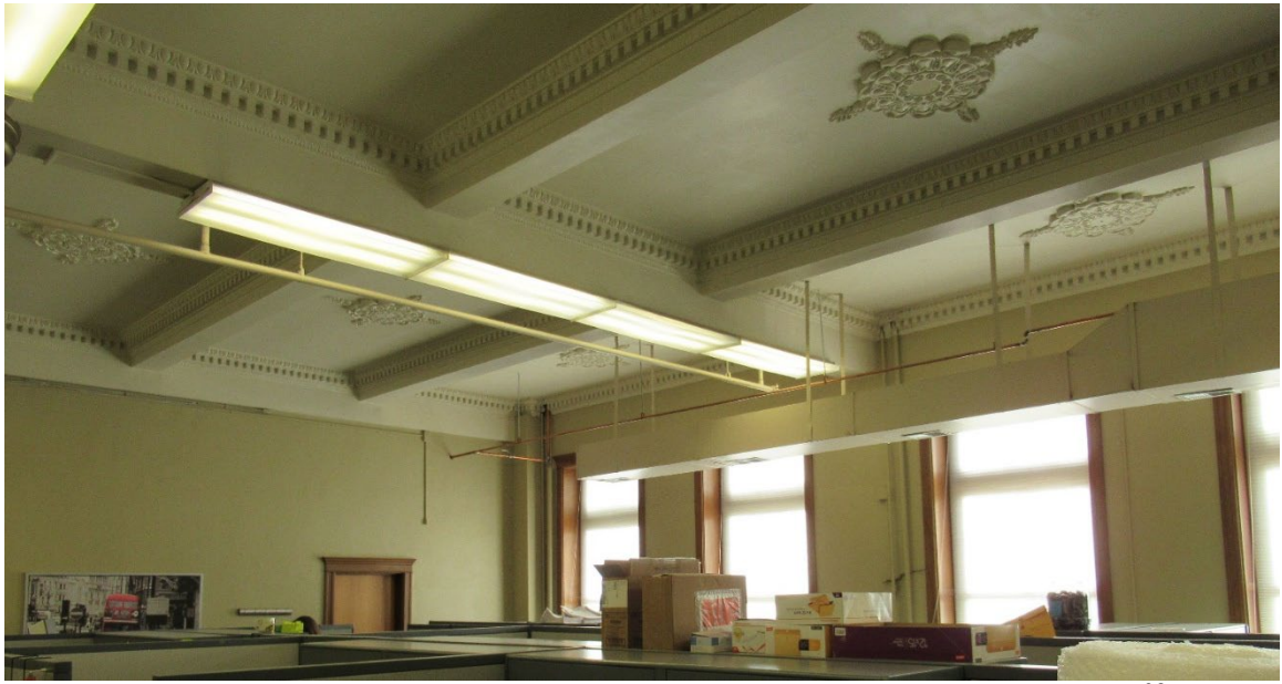
Figure B-15. Office with coffered ceiling and decorative motifs, 1916 structure.<sup>98</sup>