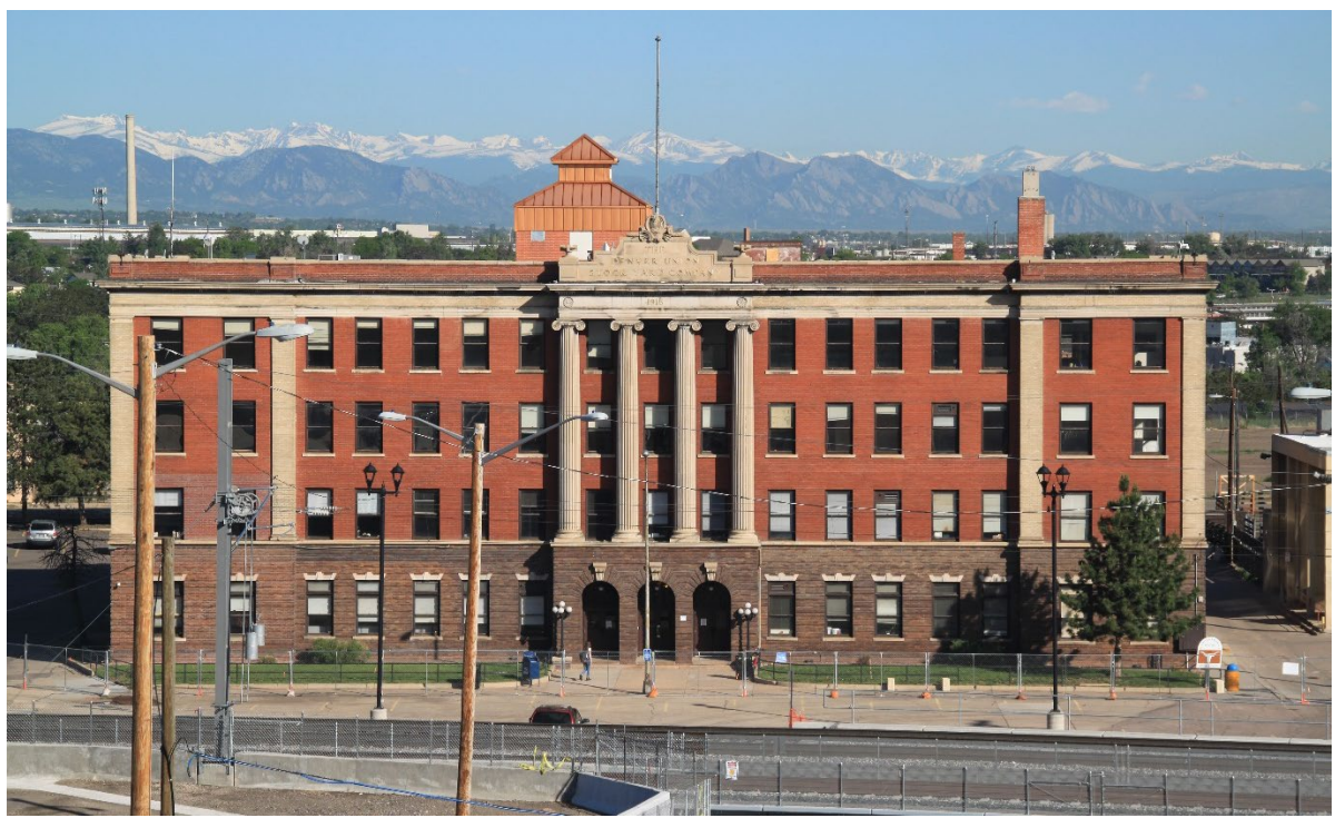
Figure B-6. Front (southeast) facade of the Livestock Exchange, 1916 structure. View facing northwest. <sup>85</sup>