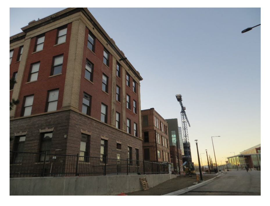
Figure B-18. 1916 (left), 1898 (center), 1919 (right) structures, View facing west. CSU SPUR buildings and crane also pictured. <sup>96</sup>