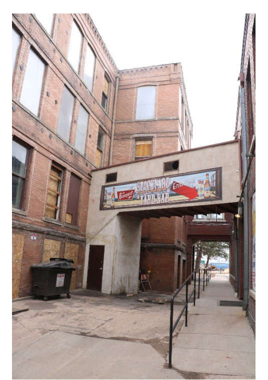
Figure B-13. Connection between 1898 and 1919 structures. Note the elevated concrete walkway, elevated brick walkway behind it, and concrete sidewalk with metal handrail. View facing southwest.<sup>91</sup>