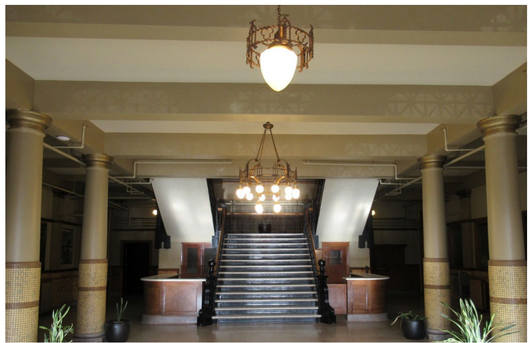
Figure B-14. Entry hall and grand staircase, 1916 structure.<sup>97</sup>