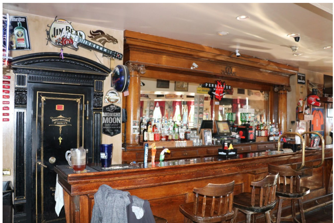
Figure B-22. Bar inside the Stockyard Saloon and Restaurant, possibly sourced from the former Windsor Hotel. Walk-in safe is original to the 1919 structure. <sup>105</sup>