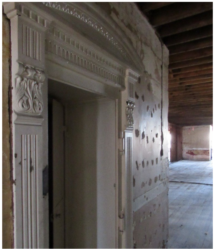
Figure B-20. Safe frame inside the 1898 structure. Frame matches the safe frame in the 1919 structure.<sup>103</sup>