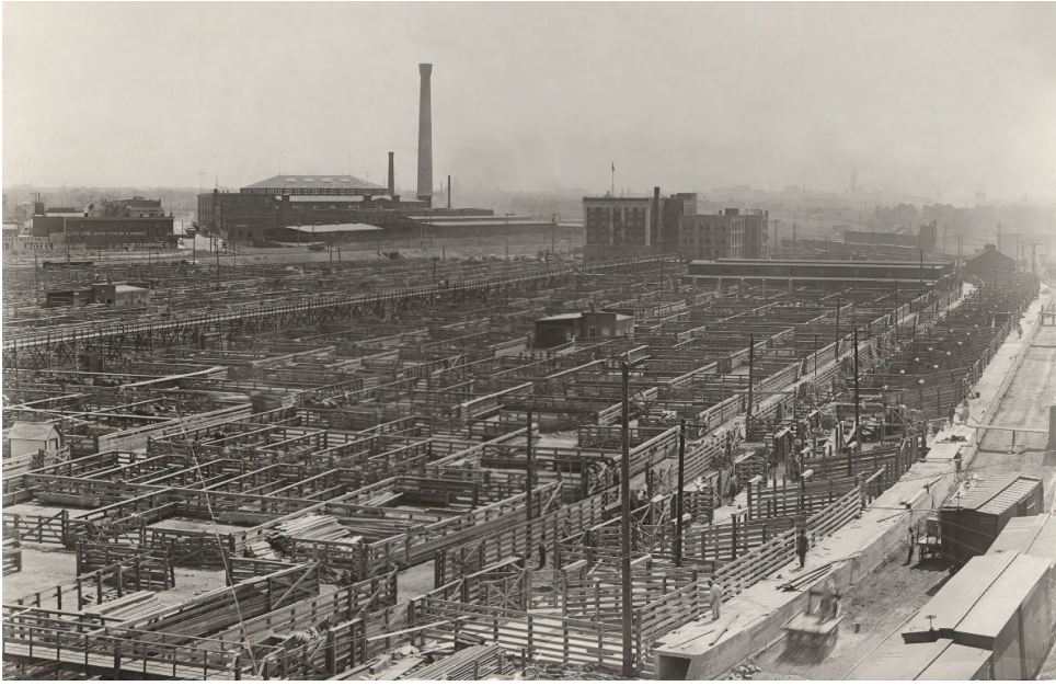
Figure B-3. Overview of the stock yards (facing south) and Livestock Exchange prior to construction of the 1919 structure. The 1909 Stadium Arena and smokestack of Omaha and Grant smelter can be seen in the background.<sup>82</sup>