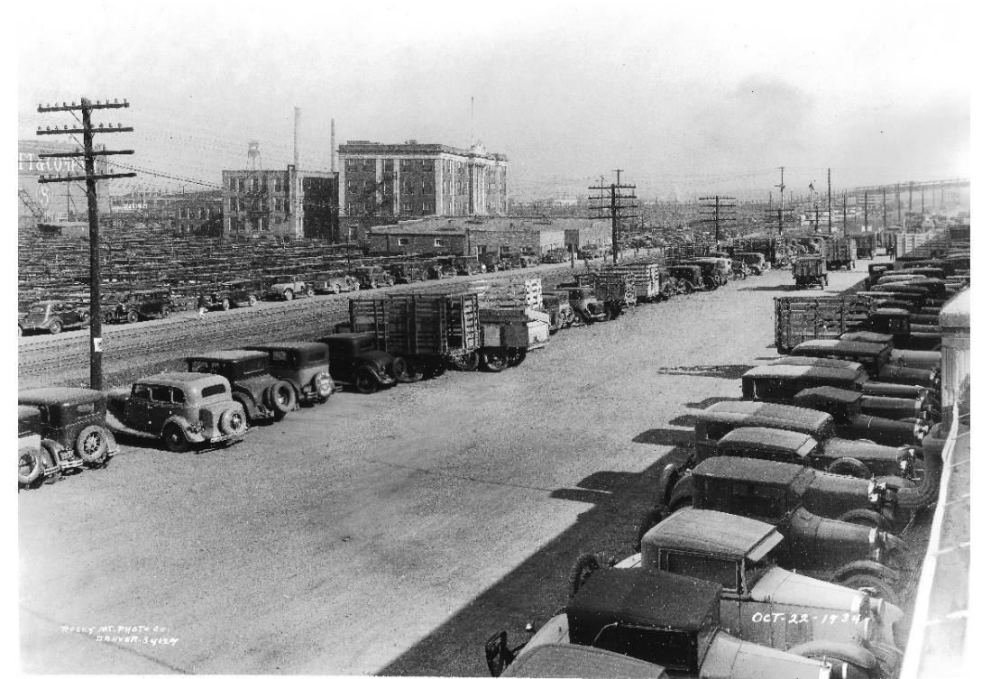
Figure B-4. 1934 photo of the complete Livestock Exchange and garage. Note the number of cars lining the streets around the yards. <sup>83</sup>