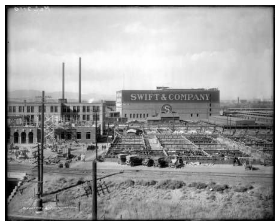
Figure B-2. Photo of the Livestock Exchange during construction of the 1916 structure. Swift and Co. packing plant seen in the background. <sup>81</sup>