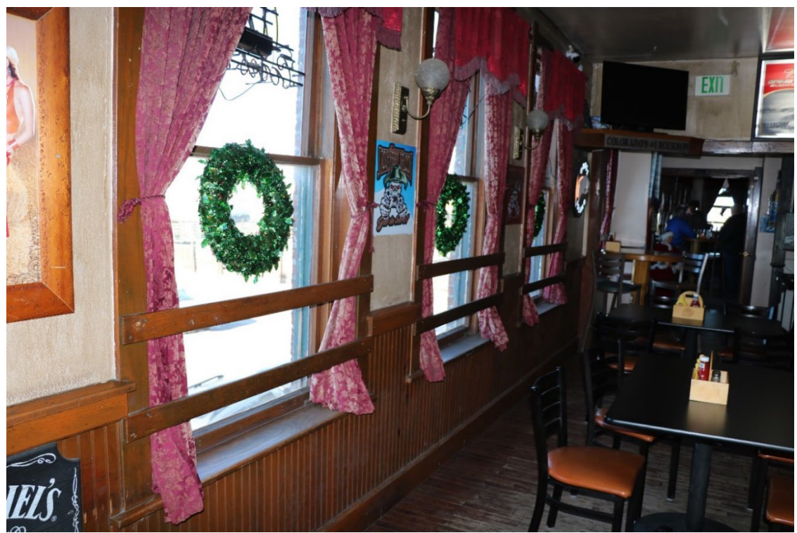
Figure B-21. Interior of 1919 structure showing wood floors, wainscoting, and window trim.<sup>104</sup>