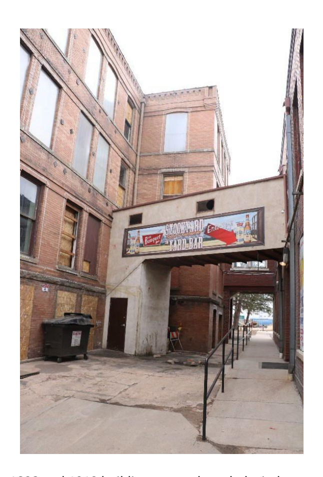
Walkway between 1898 and 1919 buildings, some boarded windows, and brick detailing Mead & Hunt photograph, November 2018

elevator tower, are not readily visible, the integrity of design, materials, and workmanship are strong. The extreme changes to the area, the demolition of the surrounding buildings and the removal of the pens greatly impact the integrity of setting and feeling. But the buildings still convey their association with the livestock industry, and the integrity of association is still retained. Overall, the property maintains good integrity.