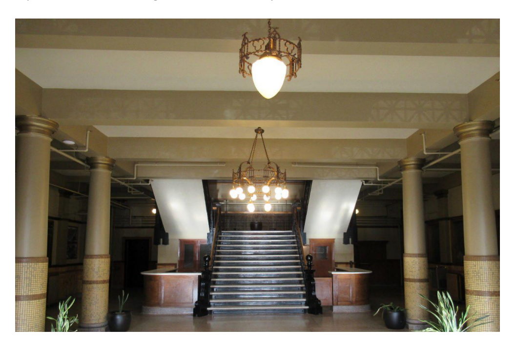
1916 Building entry hall and grand staircase (above) Chalkboard used for conducting business (below)

(NWSS) as well as the railroads, meatpacking plants, and other related businesses in the area. The interconnected buildings collectively represent the various administrative, regulatory, financial, and promotional activities associated with Denver's livestock industry, which at its peak, was the state's largest industry. The collection of three buildings demonstrates stock yard's growth over the decades with its development in 1890s through its slow demise by the 1970s.