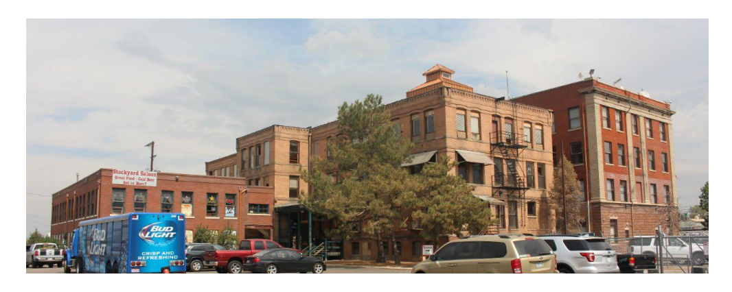
South elevations of all three buildings (above) - Mead & Hunt photograph, August 2016 East elevation of the 1916 building (below) - NWC Authority photograph, June 2019

The 1898 and 1919 structures were designed in the Early Twentieth Century Commercial style. The 1898 building's Early Twentieth Century Commercial type is evident in its flat roof, four-stories, tan masonry, and simple ornamentation in the belt courses and parapet. Similarly, the 1919 structure displays the characteristics of the Early Twentieth Century Commercial type in the simple rectangular form, flat roof, and simple decorative brick work at the cornice. The 1916 structure is a high-style Classical Revival. The structure features characteristics of the Classical Revival style in the masonry construction, three-story monumental fluted ionic columns, embossed pediment, classical entablature, and the dominate center portico.