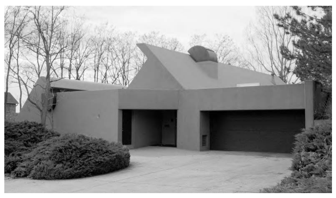
Figure 1: 401 Madison St. Kathleen Roach, "Crowther House". Historic Denver

The building embodies the distinctive visible characteristics of the Late Modern architectural style. According to the book published by Historic Denver, "The Mid-century Modern