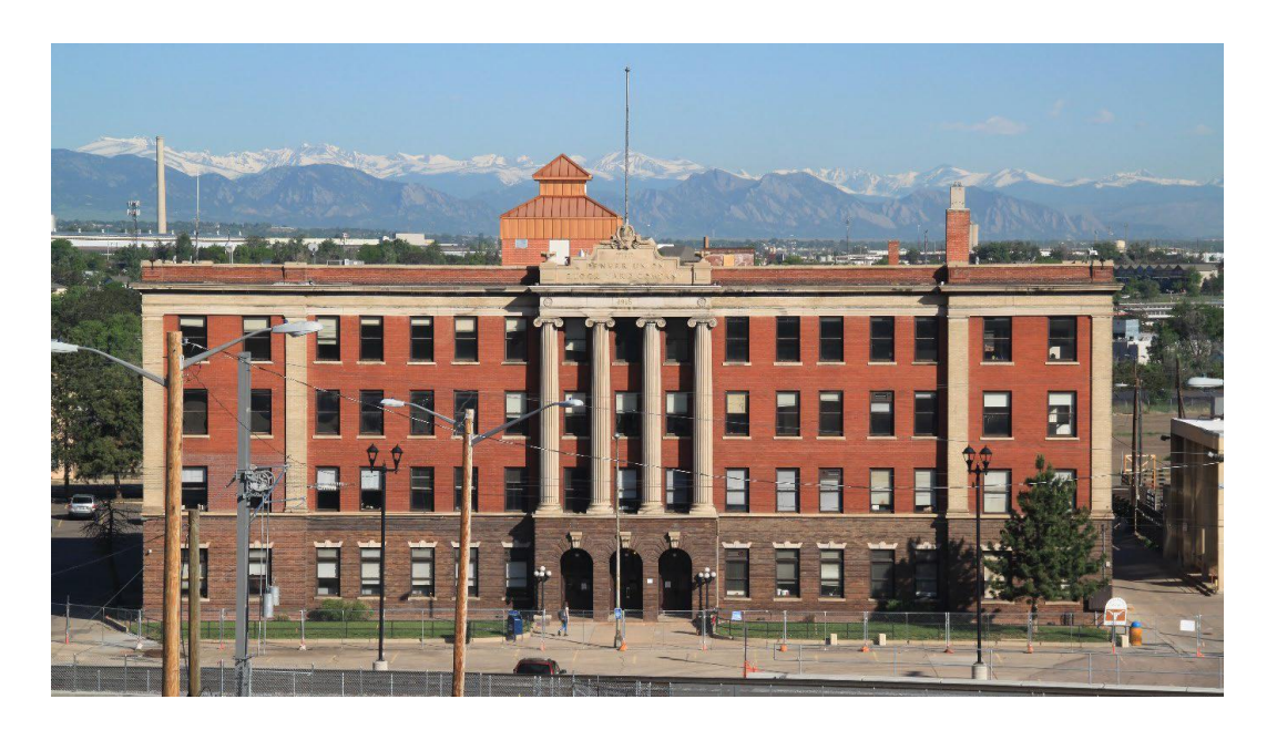
East elevation of the 1916 building - NWC Authority photograph, June 2019