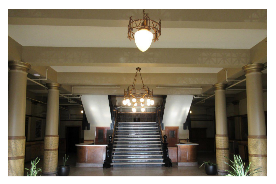
1916 Building entry hall and grand staircase

The Livestock Exchange has a direct association with the historical development of the city. The property was built in response to centralization of the growing livestock and meatpacking industries in and around the Denver Union Stock Yards (DUSY). The buildings served as the hub for the businessmen and ranchers who ran the livestock industry associated with the DUSY and the National Western Stock Show (NWSS) as well as the railroads, meatpacking plants, and other related businesses in the area. The interconnected buildings collectively represent the various administrative, regulatory, financial, and promotional activities associated with Denver's livestock industry, which at its peak, was the state's largest industry. The collection of three buildings demonstrates stock yard's growth over the decades with its development in 1890s through its slow demise by the 1970s.