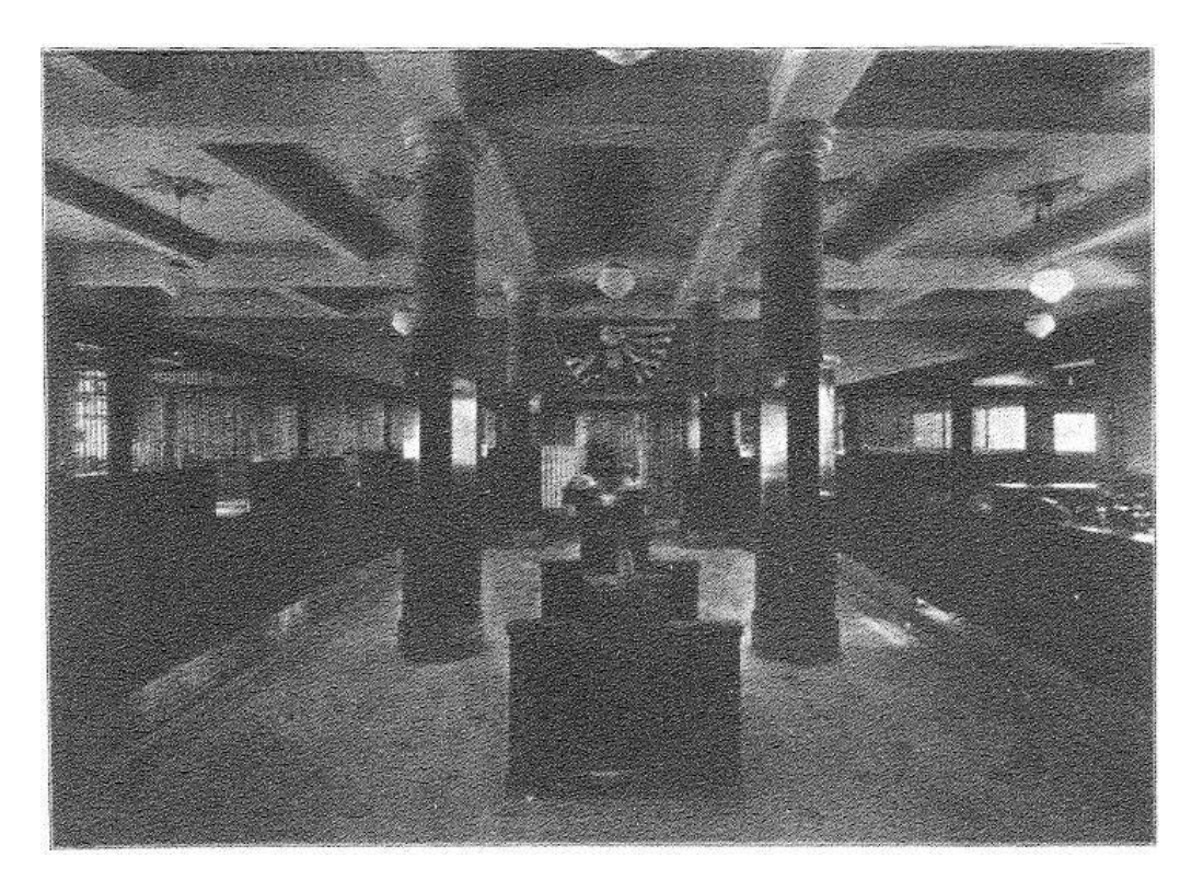
January 1918 advertisement in Record-Stockman Shows interior of building

monumental fluted ionic columns, embossed pediment, classical entablature, and the dominate center portico.