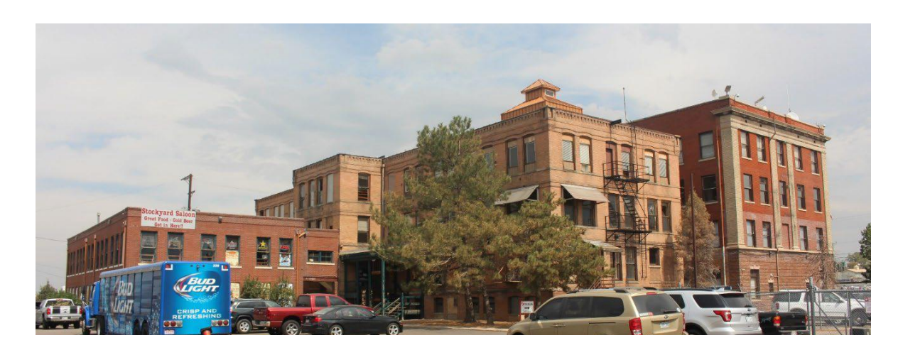
South elevations of all three buildings - Mead & Hunt photograph, August 2016