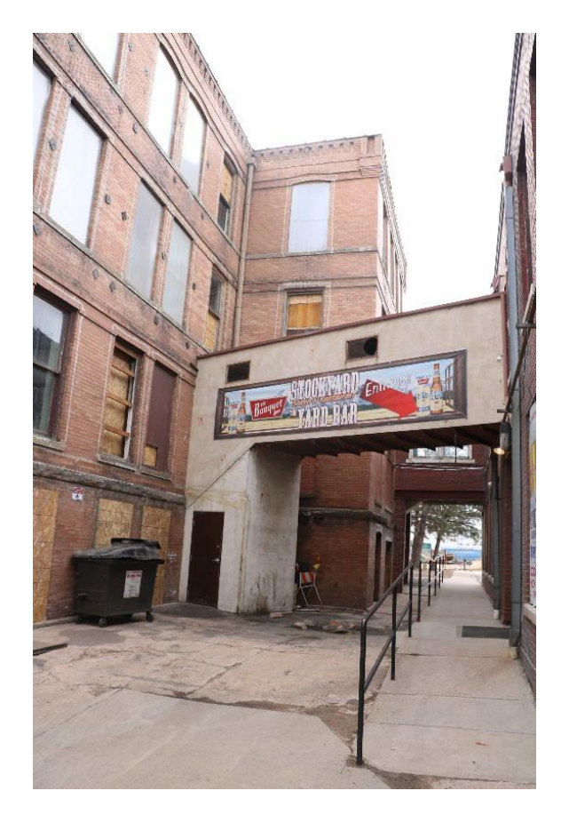
Walkway between 1898 and 1919 buildings, some boarded windows, and brick detailing November 2018