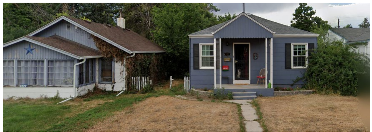
West - View of the properties to the west, directly across the street from site, looking west.