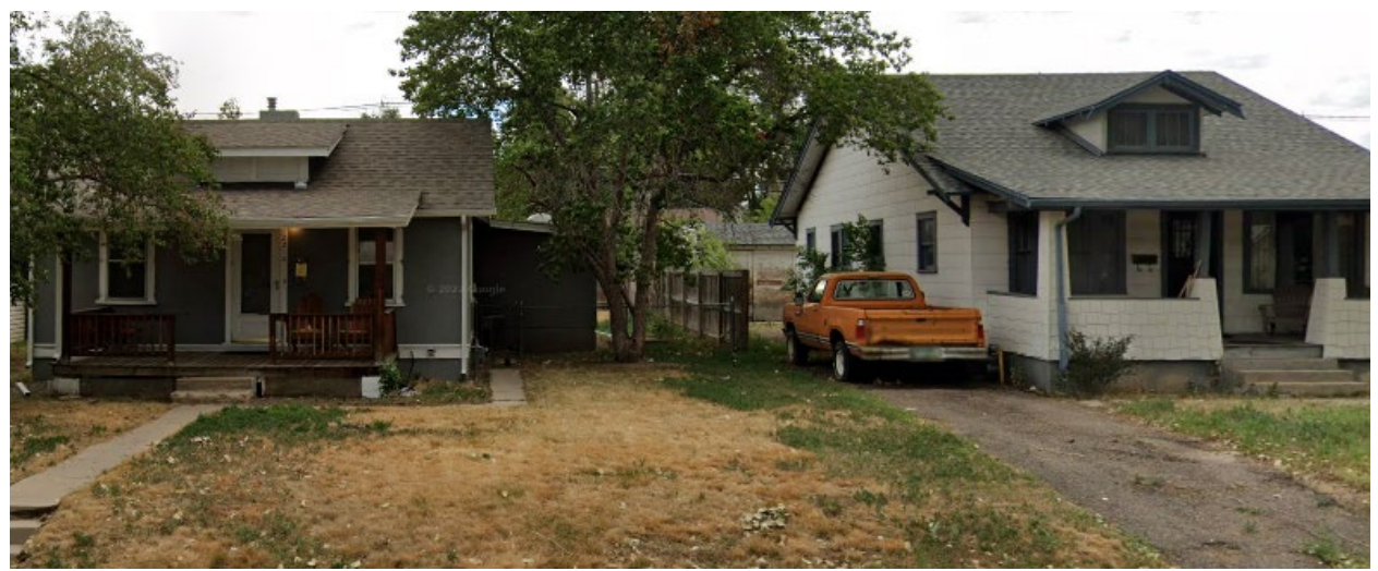
East - View of properties to the east, looking west (Gilpin Street)