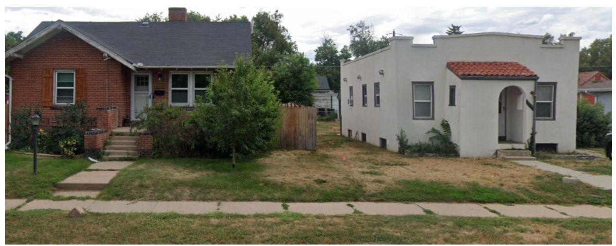
South - View of properties to the south, looking east.