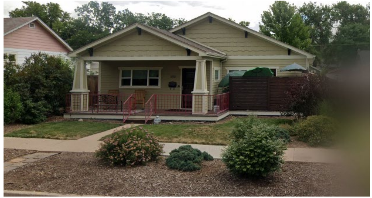
Subject Site - View of the subject property, looking east.