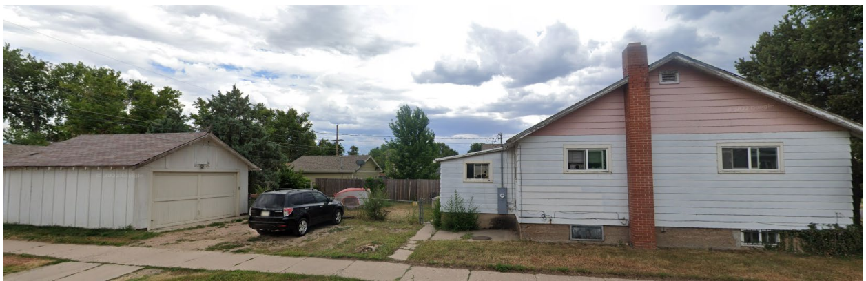
North - View of the property to the north, looking south from East Warren Avenue, including site's garage in distance