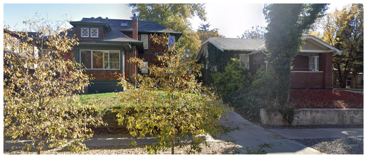
View of the properties across the alley to the west on S. Emerson St, facing east.