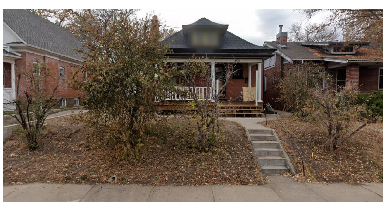
View of the subject property, facing west