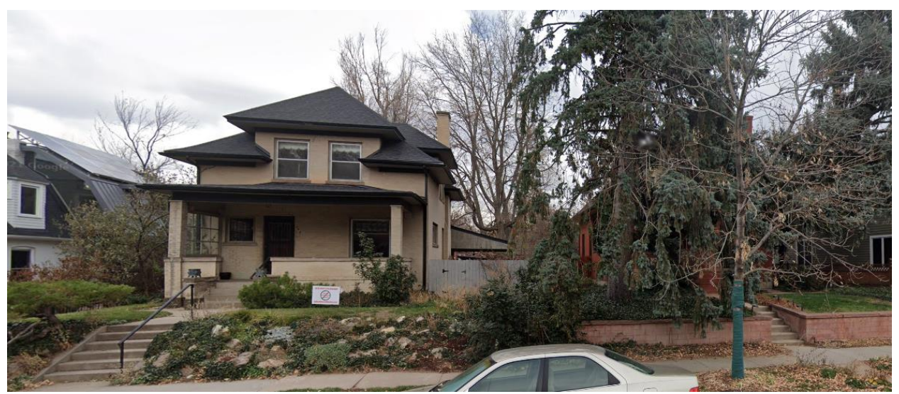
View of the properties to the east across S. Ogden Street, facing east.