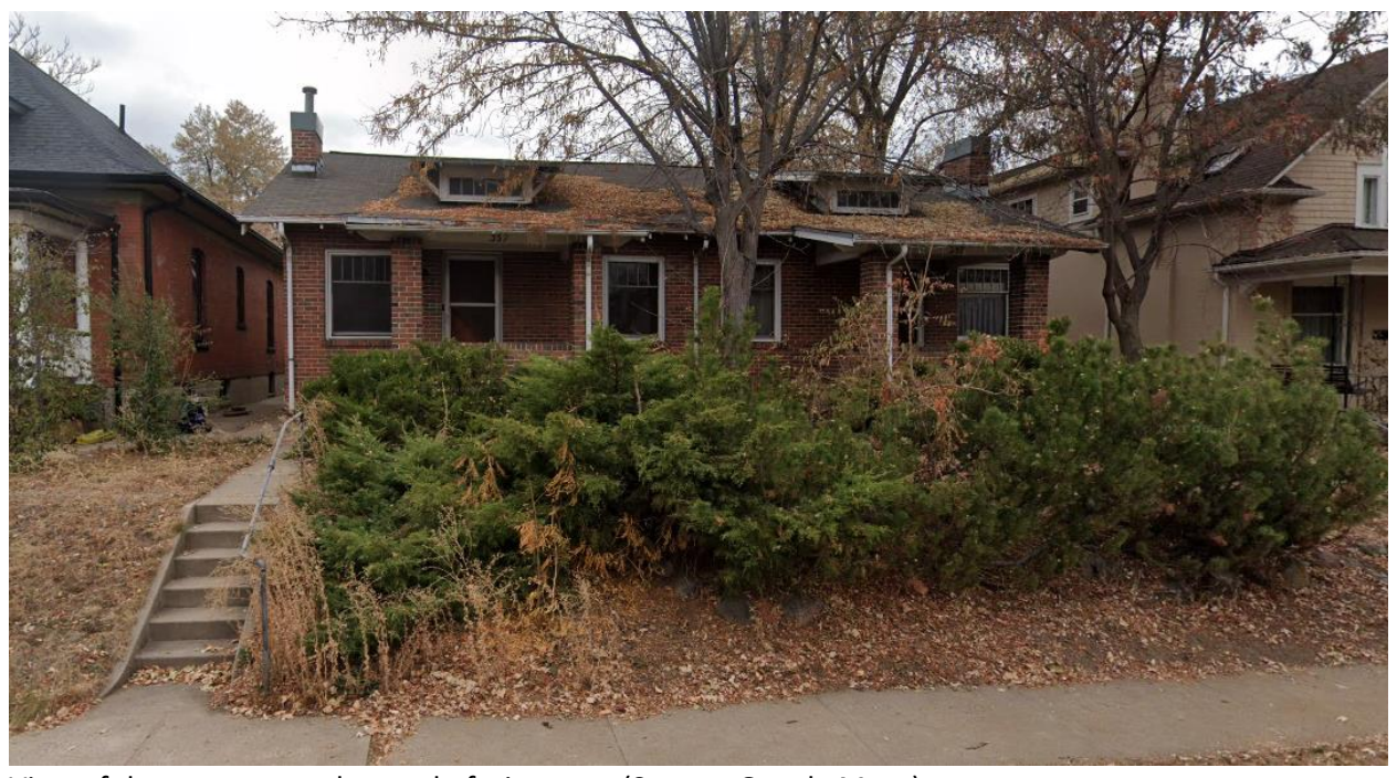
View of the property to the north, facing west