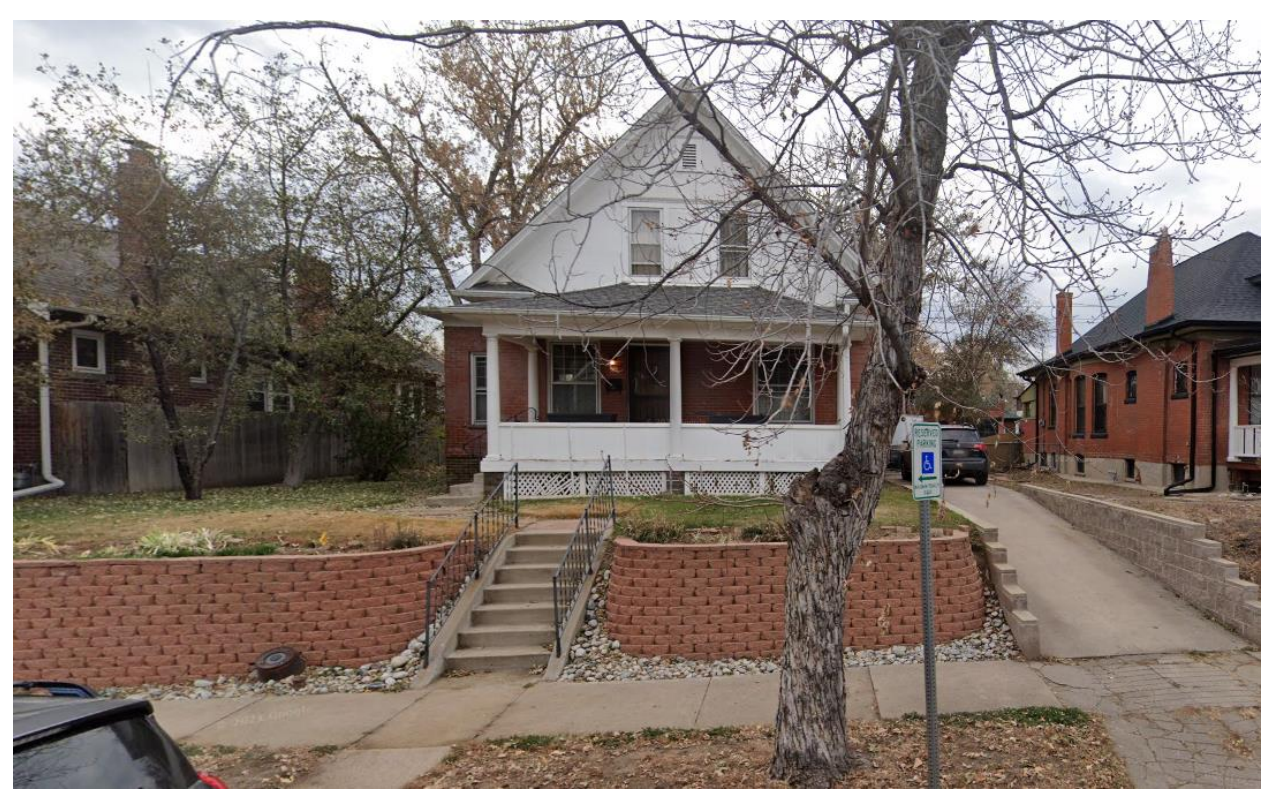
View of the property to the south, facing west