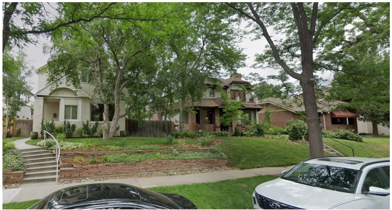
View of properties south of the subject property, looking east.