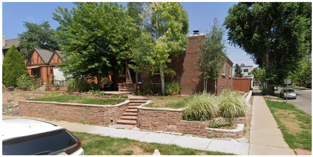
View of single-unit home to the north, looking east.

View of single-unit homes across South Vine Street of the subject property, looking west.