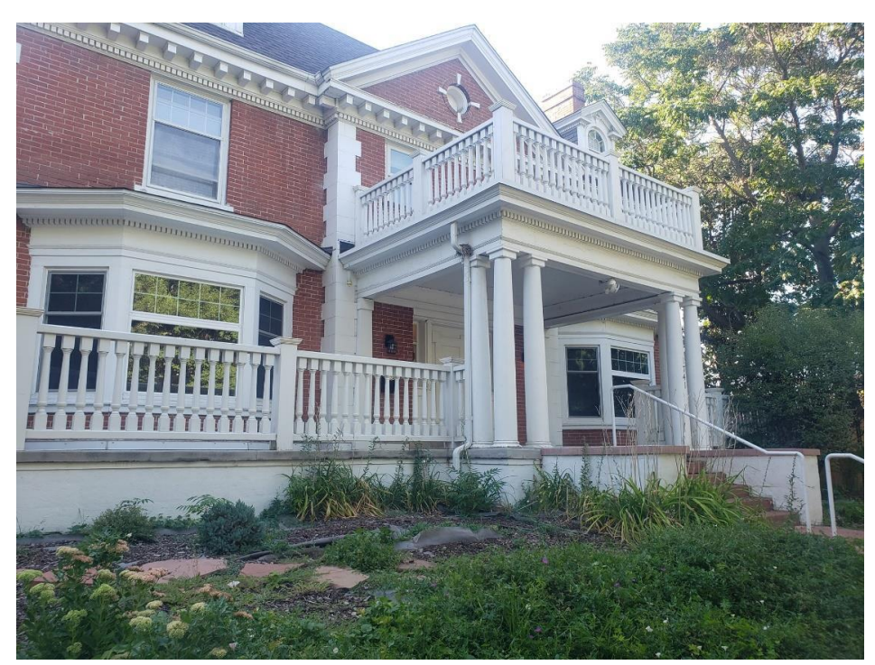
1741 Gaylord Street, front façade

The structure at 1741 Gaylord Street, which was one of the larger and earlier properties constructed in the neighborhood, embodies the distinctive visible characteristics of the Dutch Colonial Revival style. The characteristics of this style seen in the structure are the side gambrel roof with overhanging eaves, dormers, symmetrical façade, a pediment with round window, balcony supported by columns above the main entrance, front door flanked by sidelights, 8-over-1 windows, brackets, dentils, quoins, and gable-end chimneys. The property displays the characteristics of the Dutch Colonial Revival style.