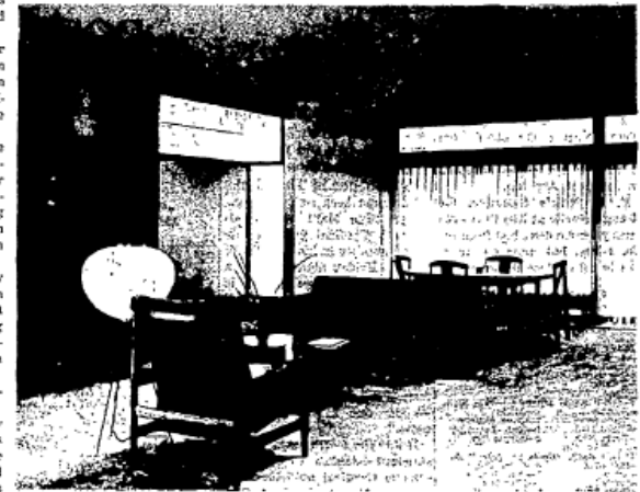
LIGHT FROM DOME ILLUMINATES LIVING ROOM

In use there's no doubt . . . It opens the door to one of Denver's definitely different homes