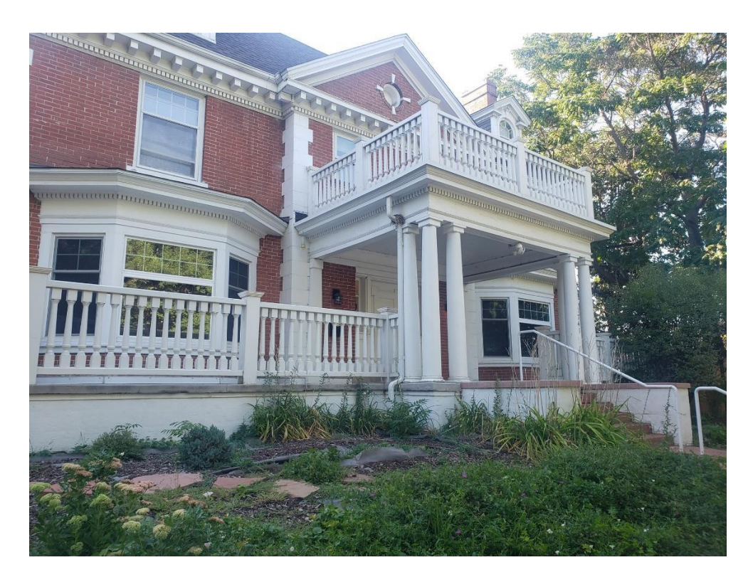
1741 Gaylord Street, front façade

The structure at 1741 Gaylord Street, which was one of the larger and earlier properties constructed in the City Park West neighborhood, embodies the distinctive visible characteristics of the Dutch Colonial Revival style. The characteristics of this style seen in the structure are the side gambrel roof with overhanging eaves, dormers, symmetrical façade, a pediment with round window, balcony supported by columns above the main entrance, front door flanked by sidelights, 8-over-1 windows, brackets, dentils, quoins, and gable-end chimneys. The property displays the characteristics of the Dutch Colonial Revival style.