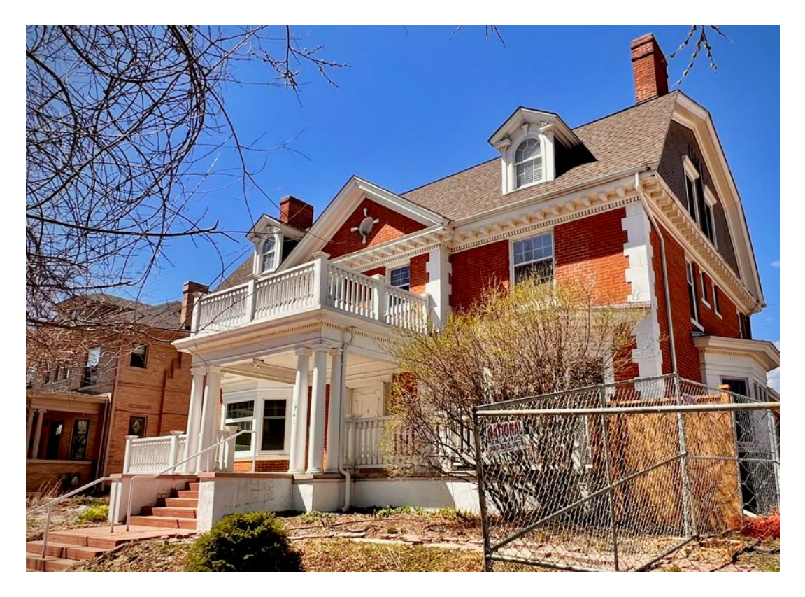
1741 Gaylord, front facade