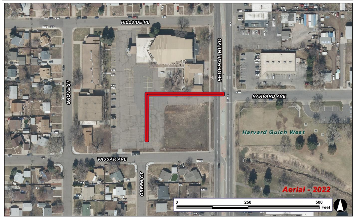
Summary map of base Zone District rezonings proposed by rezoning proposal 2021I-00023 (adopted rezoning ordinance 20210759). The area impacted by this proposed correction rezoning is highlighted.