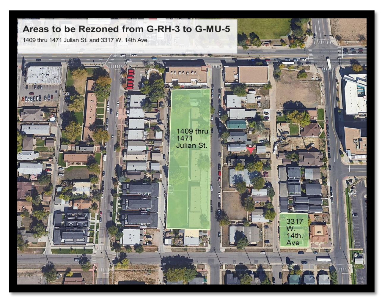
Figure 1: Aerial of Existing Conditions