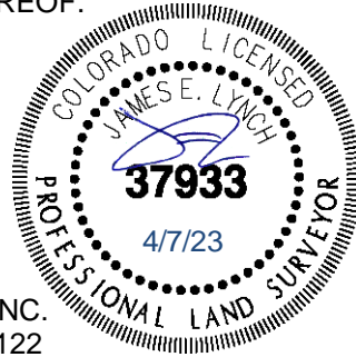
ILLUSTRATION ATTACHED AND MADE A PART HEREOF.