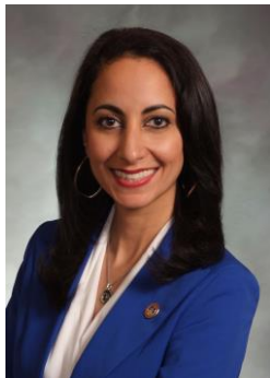
Senator Iman Jodeh, SD 29