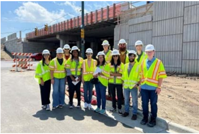
FIGURE 3: SUMMER 2023 ATKINSRÉALIS DENVER INTERN COHORT WITH I-70 AND HARLAN PROJECT STAFF

Additionally, AtkinsRéalis sees the need for more diversity internally in our Denver office and recognizes our responsibility as an industry leader to support a more diverse workforce. To that end, we have initiated an internship program with local high schools designed to introduce our industry to youth who identify with historically marginalized groups. With this internship program, we have the express intent of helping these students cultivate skills and professional experiences that will help them compete in the job market after they have completed their education. Our hope is to build strong, trusting relationships with these students so they return to our internship program throughout their education and view AtkinsRéalis as a potential future employer.