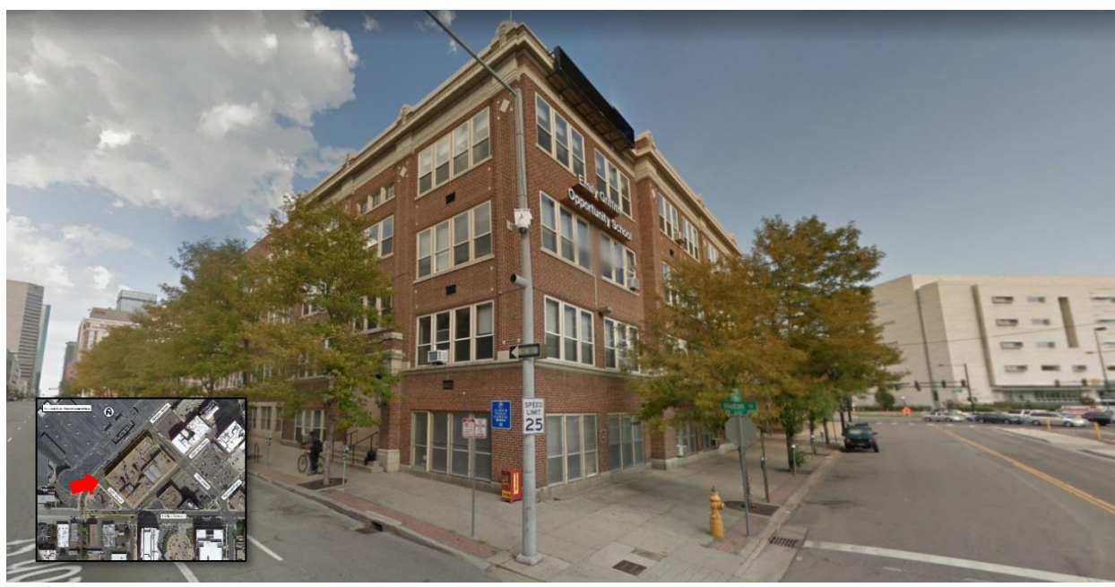
Proposed Urban Redevelopment Area, View from Welton Street and 12<sup>th</sup> Street looking northeast