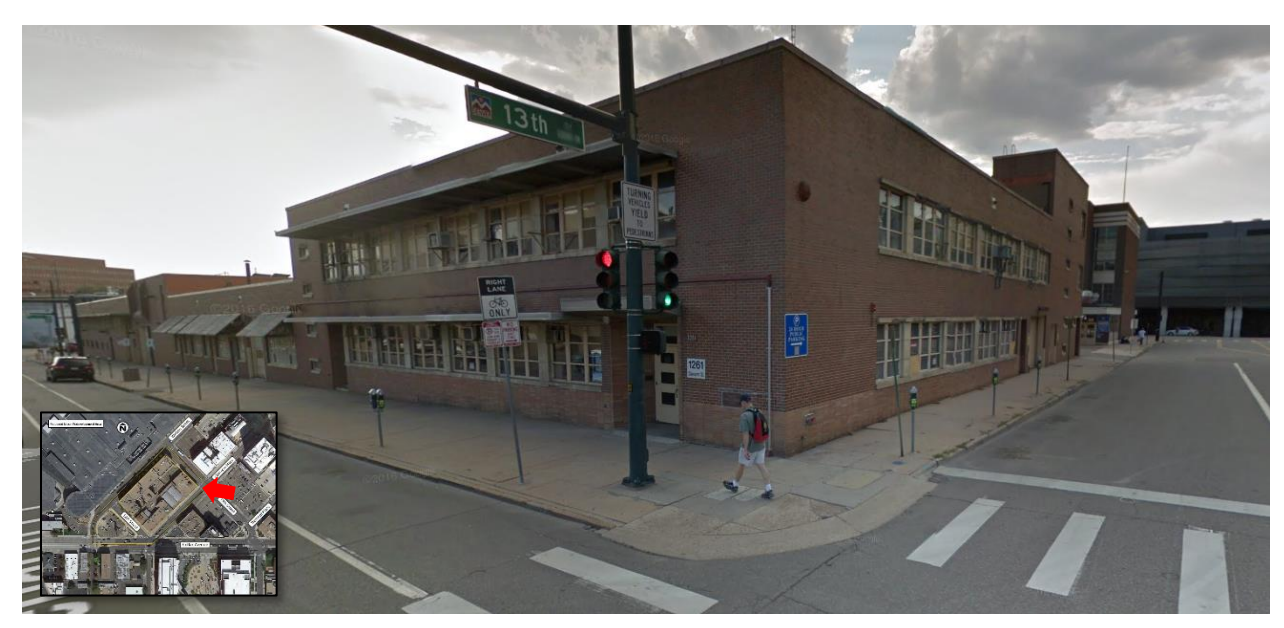
Proposed Urban Redevelopment Area, View from Glenarm Place and 13th Street looking northwest