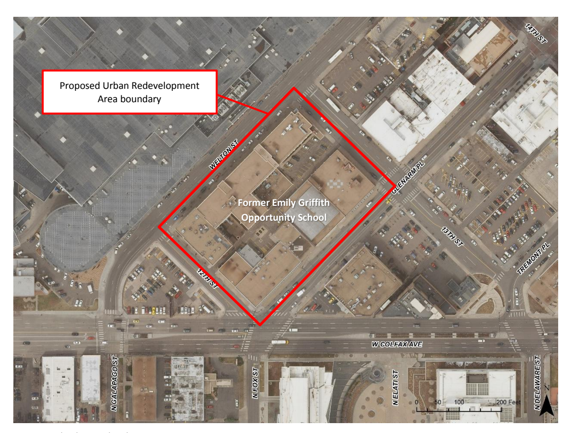
Proposed Urban Redevelopment Area