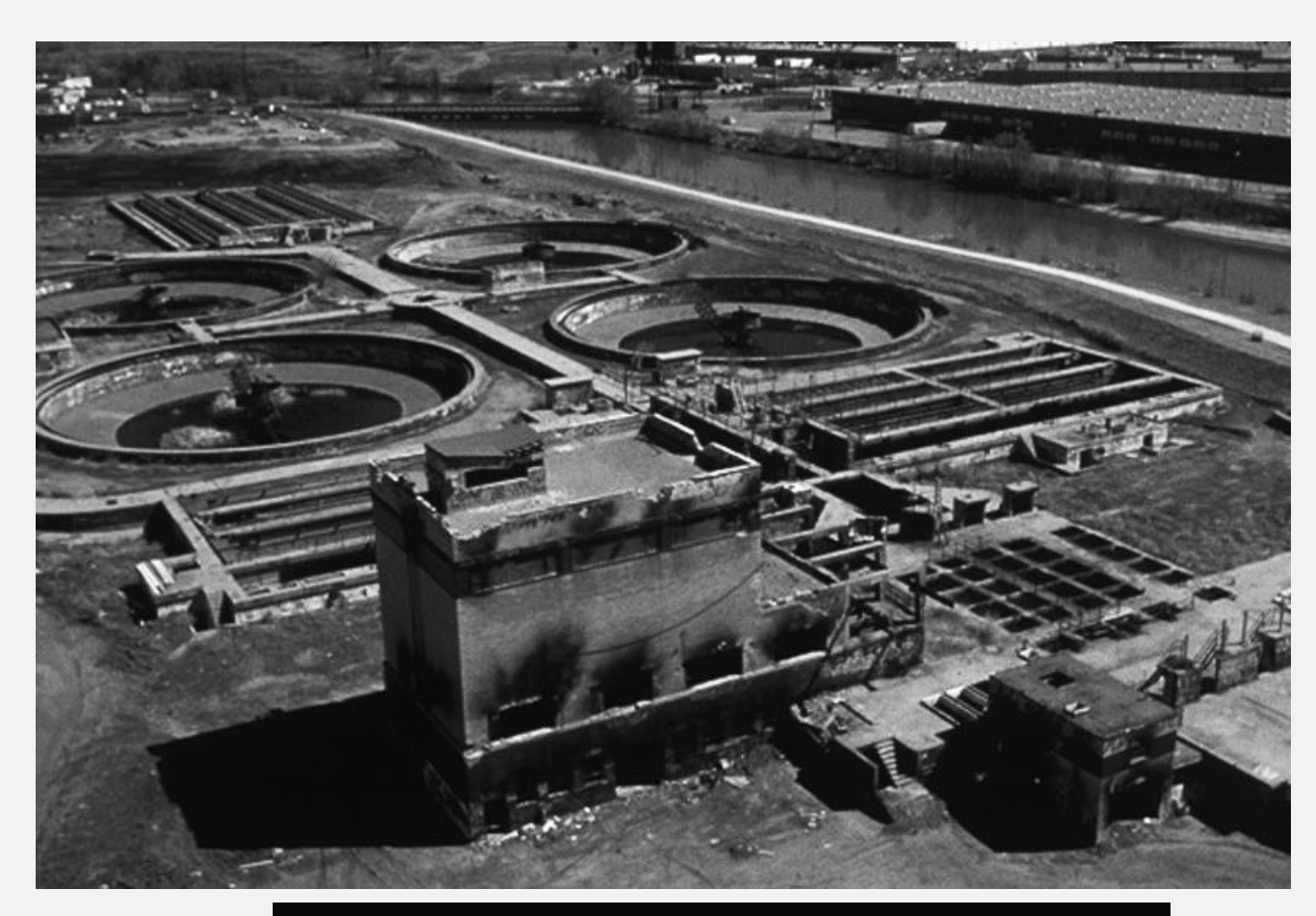
Northside Wastewater Sewage Treatment Facility