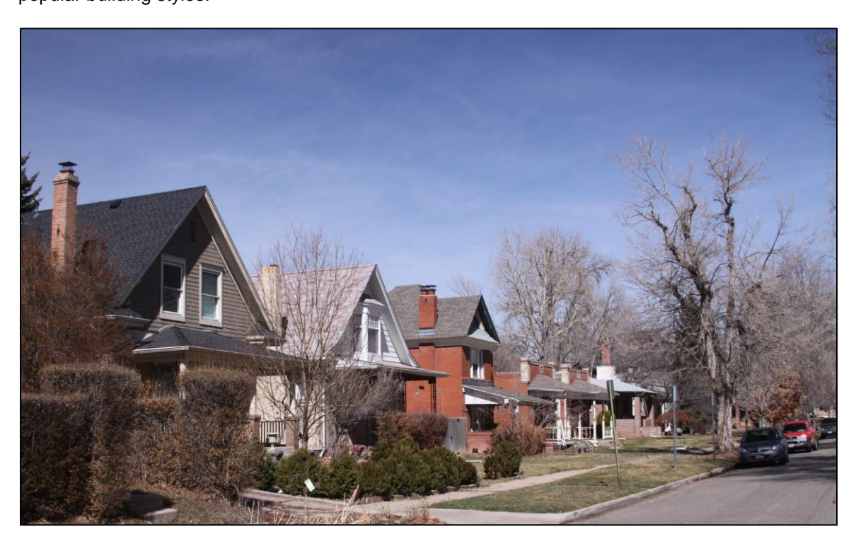
3300 block of Osceola

a) Embody distinguishing characteristics of an architectural style or type; The district embodies distinguishing characteristics of architectural styles and types that illustrate the evolution of middle class housing types and styles over time. While there are a few large, high style structures designed for wealthy residents, the predominate building stock reflects middle class housing. Within the district, the largest percentage of houses are Queen Anne style structures primarily built before the Silver Crash of 1893. As the economy recovered, the changes in popular architectural styles are seen in numerous turn of the century Classic Cottages and the related, but larger Denver Squares. Preferences in types and styles continued to evolve as Bungalows, English cottages, and Terrace type buildings became more prevalent. Packard's Hill shows Denver's history of building predominantly in brick, while following nationwide trends in popular building styles.