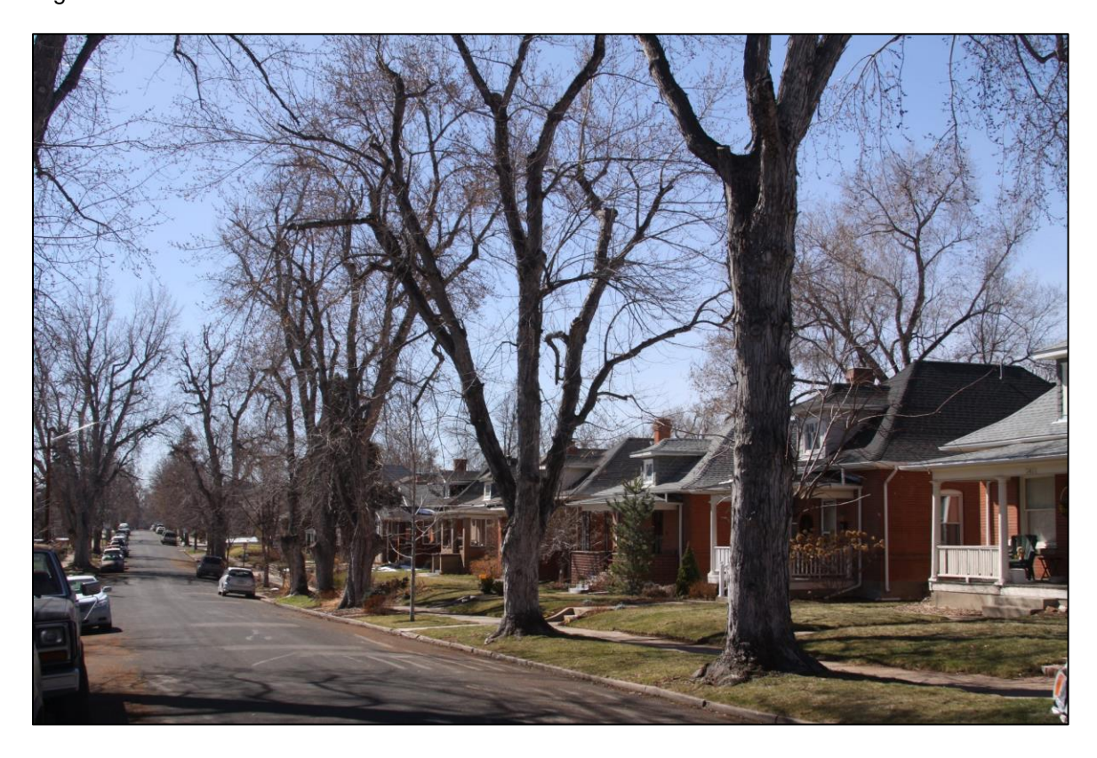
3400 block of Meade

The existing district retains a high degree of integrity. Although there have been some changes outside the district due to changes and growth in the surrounding area, the neighborhood is still urban residential in nature and in the same location; retaining both integrity of setting and location. While there have been modifications to some of the structures within the district, the overall integrity of design, materials, and workmanship are readily apparent. The continued use as a residential area helps retain a strong sense of feeling and association.