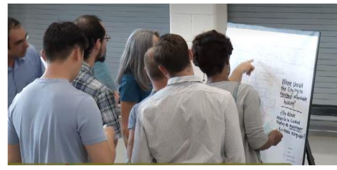
Comp Plan Public Meeting, 6/29/17

Two neighborhood meetings were also held during the plan development in North Denver