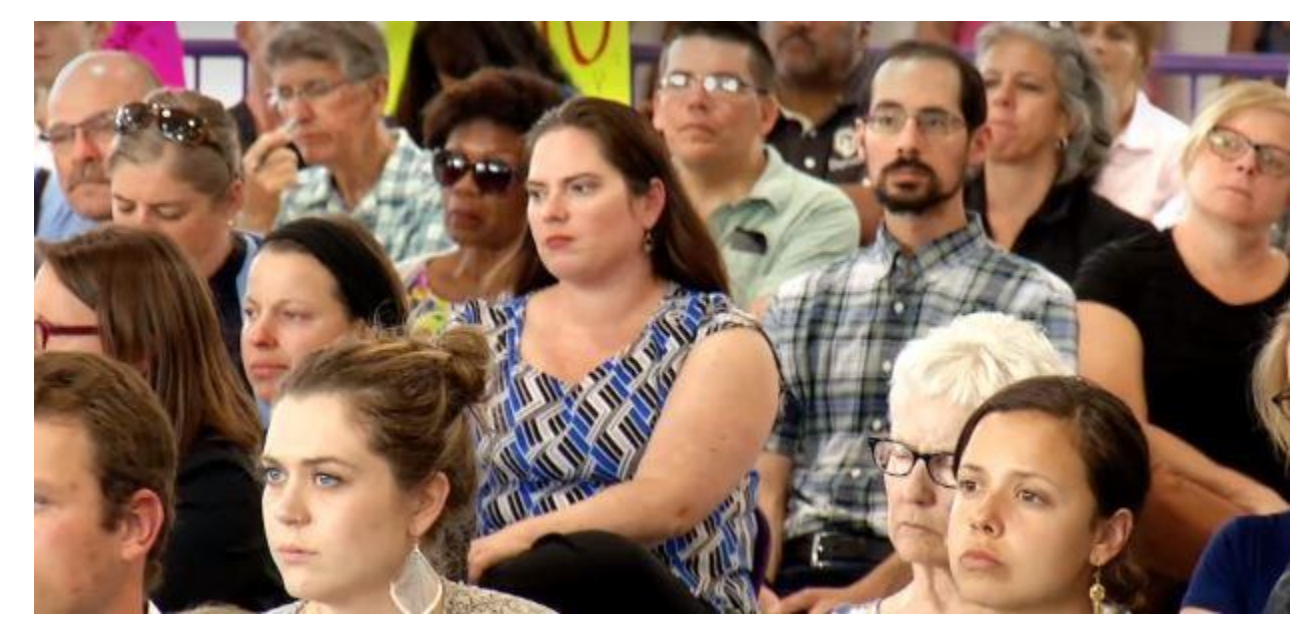
Comp Plan Public Meeting, 6/29/17