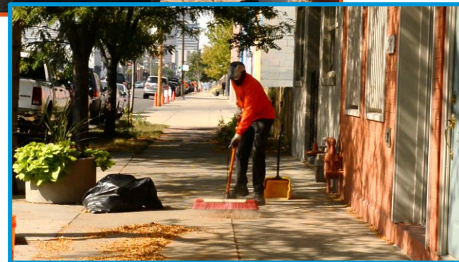
Denver Day Works workers helping keep RiNo clean during CRUSH – the neighborhood's week-long celebration of graffiti and street art.