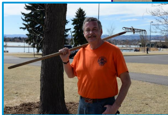
Denver Day Works workers maintaining tree beds at Sloan's Lake in March.