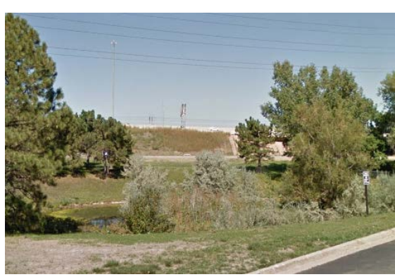
North – from Ulster St.