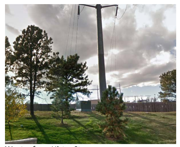
West – from Ulster St.