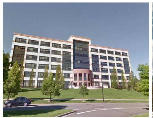
South – from Ulster St.