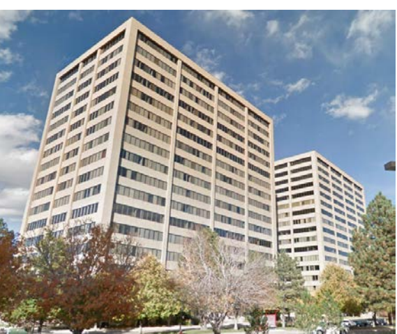
East – from Ulster St.