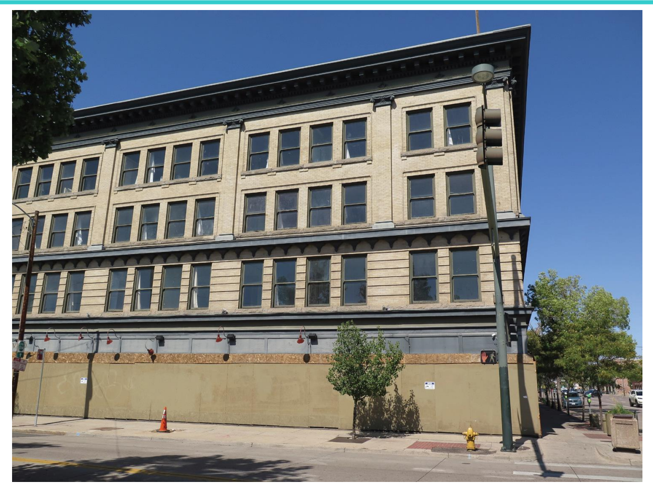
Finance and Governance Council Committee May 15, 2018