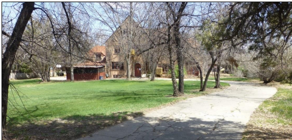
2900 South University Blvd, Front façade and drive