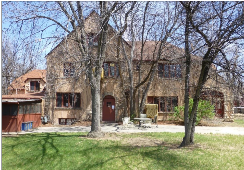
2900 South University Blvd, photo 2018

Planning Services Community Planning and Development 201 W. Colfax Ave., Dept. 205 | Denver, CO 80202 www.denvergov.org/CPD p. 720.865.2983