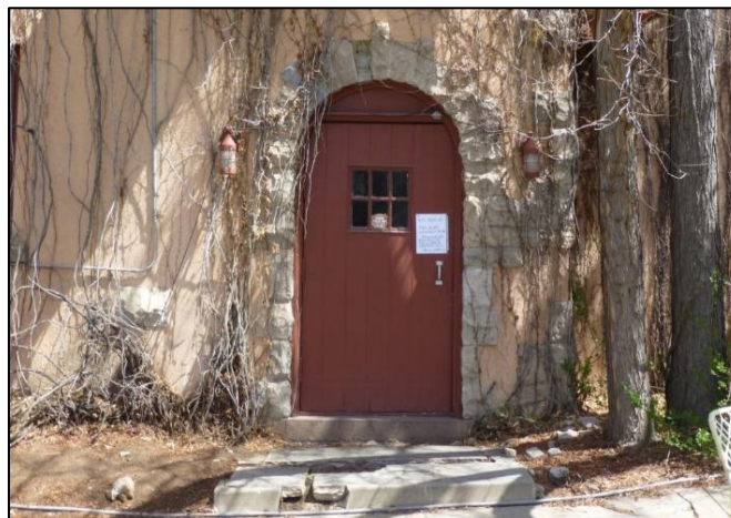
2900 South University Blvd, Window, door, and stone detailing