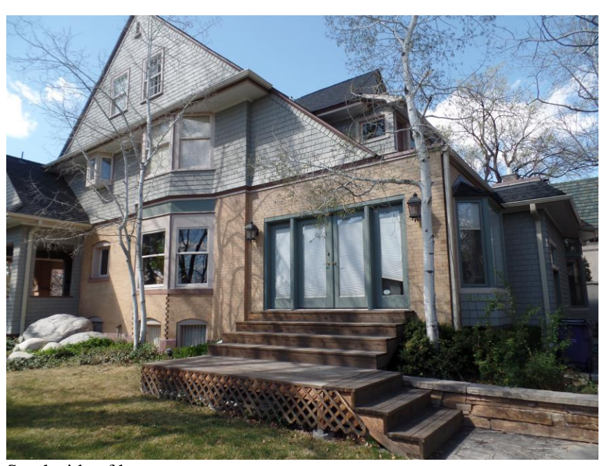
South side of house