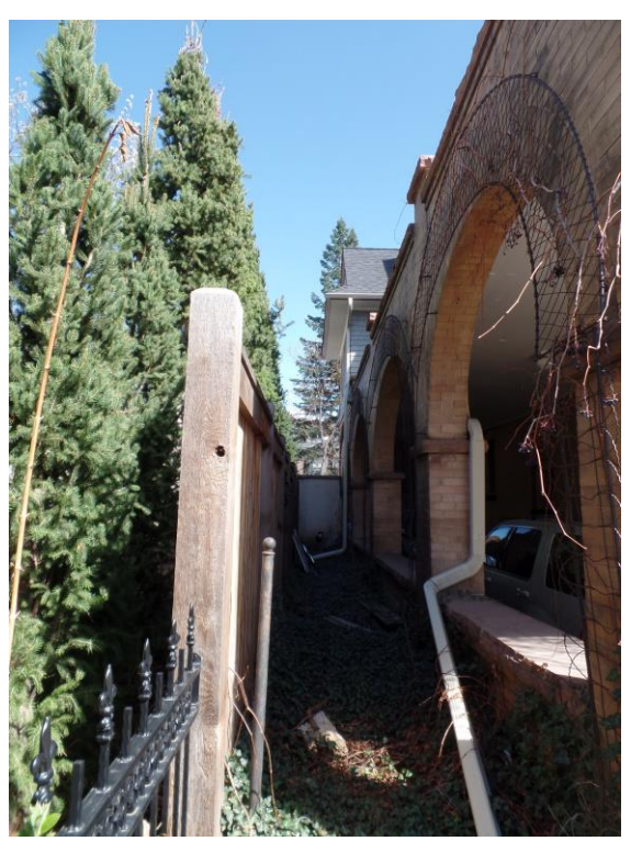
North side of house and porte cochere