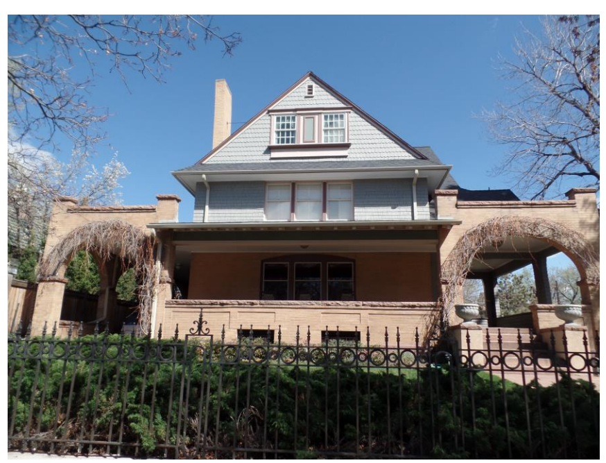
West side of house facing Marion Street