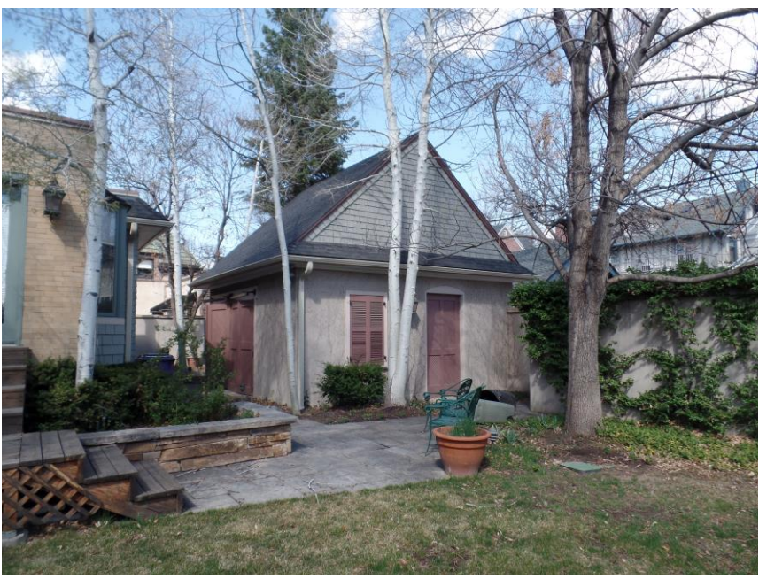
Carriage house from the south